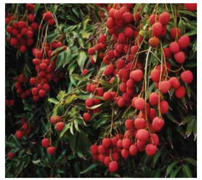
Lychee, Litchi chinensis Sonn.

There are no U.S. or international standards. One piece fiberboard boxes 2.25 kg (5 lb) or 4.5 kg (10 lb) with polyethylene film liners are used. Fruit are also packed into 0.5 pint (0.12 L) styrene containers.