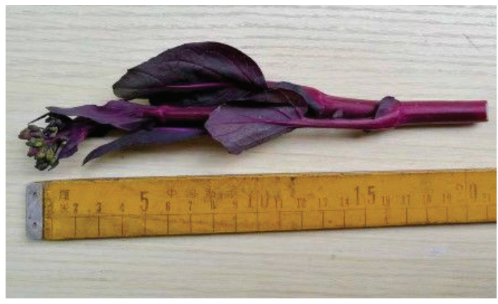
Figure 2. A purple cai-tai choy sum shoot of about 8 inches (20 cm) in length.

but prefers fertile and well-drained soils (Moore and Morgan 1998). It can tolerate moderate water deficit but is susceptible to waterlogging (Chin 1999). Choy sum should be planted in raised beds if waterlogging or heavy rain is a problem. The preferred soil pH range is 6-7 (Moore and Morgan 1998). In sandy soils, the typical plant spacing is 11 inches (28 cm) between rows and 8-12 inches (20-30 cm) between plants (Vavrina 1992). Seeds are planted at the depth of 0.24 inches (0.6 cm) (Moore and Morgan 1998). Transplants are often used for varieties with larger plant size and longer growth period (PlantUse English 2016). Harvest begins 30-50 days (Nguyen 1992) after sowing when the flower buds are fully developed but not open. Leaves, flower buds, and stems are harvested together. There are two to three harvests for each season, and the total yield is 9,800 to 16,000 lb/acre (11-18 t/ha) (Shuler 1995). Larger seeds and appropriate irrigation can improve yield and product quality (Yip et al. 1976). It is vulnerable to inadequate water and nitrogen fertilization (Nobel 2009).