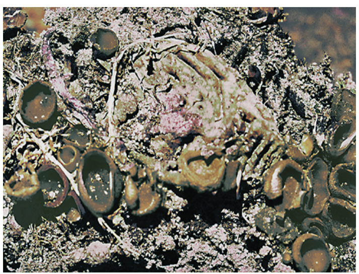
Figure 3. The overwintering structure (apothecia) of the brown rot fungus, which is growing on a fruit mummy.

Wilting and powdery masses of secondary asexual spores called conidia will be observed on the flower shuck on infected blossoms. The infection can spread from the flower, into the spur, then the twig, where it will form a canker. Conidia will continue to be produced throughout the early summer from these cankers. Conidia can infect blossoms, green twigs, and green through fully ripe fruit.