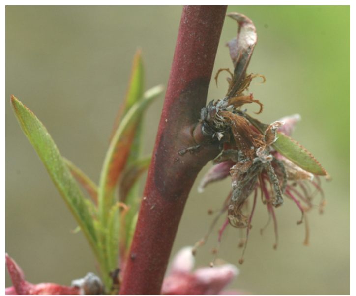
Figure 5. Blighted blossom and shoot and twig canker on a peach tree.

potential to girdle and kill a shoot, resulting in twig blight. At this point, the leaves on the blighted twig will wilt and turn brown, but they can remain attached to the branch for a few weeks (Bush et al. 2015).