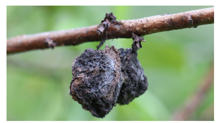
Figure 2. Peach mummies are the most significant source of overwintering brown rot fungal inoculum.

Infection can occur over a broad range of temperatures (32°F to 86°F; 0°C–30°C), with an optimum temperature range of 72°F to 77°F (22°C–25°C). However, if plant material remains wet for 24 hours or more, brown rot fungus infection is most likely to occur, regardless of the air temperature (Bush et al. 2015).