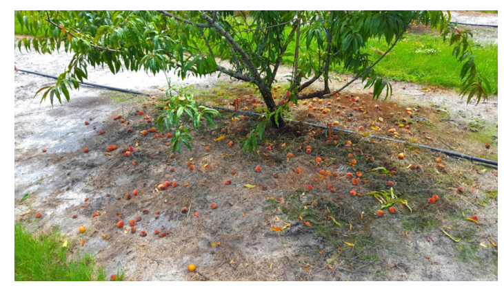
Figure 8. Without proper management, losses from brown rot infection can be 100 percent.

Weak, dead, and cankered branches and twigs should be pruned throughout the winter and spring. Pruning the canopy to create more space between branches can help reduce inoculum by increasing sunlight and airflow. The use of microjet irrigation versus rain/overhead irrigation is recommended to avoid wetting fruits, flowers, branches, and twigs (Rungjindamai et al. 2014). Opening the canopy can improve chemical treatment coverage overall, which will show better results as well as use resources more effectively. Thinning fruits along the branch is extremely important because fruits making contact with each other show a higher incidence of infection due to increased contact with inoculum. Fruits that appear stunted should be thinned as well to remove another possible source of inoculum (Bush et al. 2015). Follow UF/IFAS recommendations to avoid excess nitrogen fertilizer, because too much nitrogen can lead to the greater susceptibility of the tree to disease (Byrne et al. 2012).