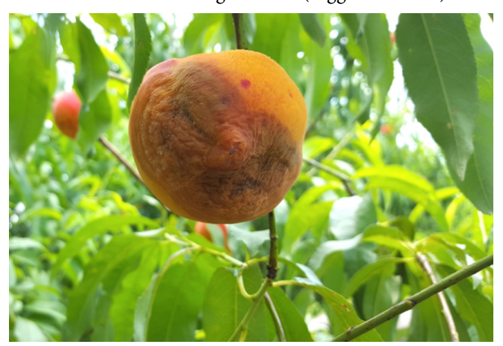
Figure 6. Early infections of the fungus that causes brown rot to appear as soft, brown spots.

Young, immature fruits are susceptible to infection, but infections remain dormant, and symptoms do not typically develop until fruits near maturity. Fruits become more susceptible to infection as they mature. The first symptoms on mature fruit will appear as soft, brown spots that can quickly engulf the entire fruit (Figure 6). These spots will expand and produce spores (conidia) until covered in a powdery, tan mass. If allowed to come into contact with other plant material, these spores can cause the death of other branches (Beckerman 2015). Infected fruits will decay and shrivel until brown to black in color, either detaching from the tree or remaining attached (Biggs et al. 1995).