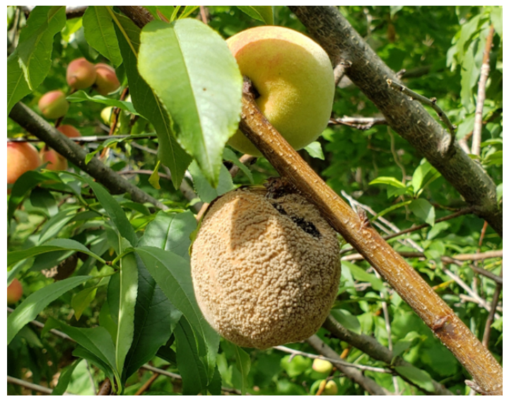
Figure 7. The brown rot fungus is sporulating on a mature peach.