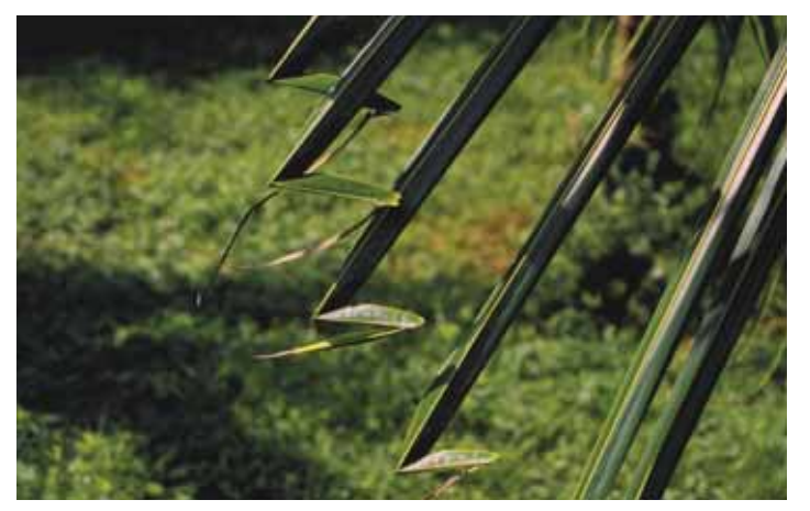
Figure 1. Cocos nucifera with "hookleaf," a mild syptom of B deficiency.

One of the earliest symptoms of B deficiency on Dypsis lutescens (areca palm) and Syagrus romanzoffiana (queen palm) is transverse translucent streaking on the leaflets. In many species, including Cocos nucifera (coconut palm), Elaeis guineensis (African oil palm), and S. romanzoffiana , mild B deficiency can be manifested as sharply bent leaflet tips, commonly called "hookleaf" (Figure 1). These sharp leaflet hooks are quire rigid and cannot be straightened without tearing the leaflets.