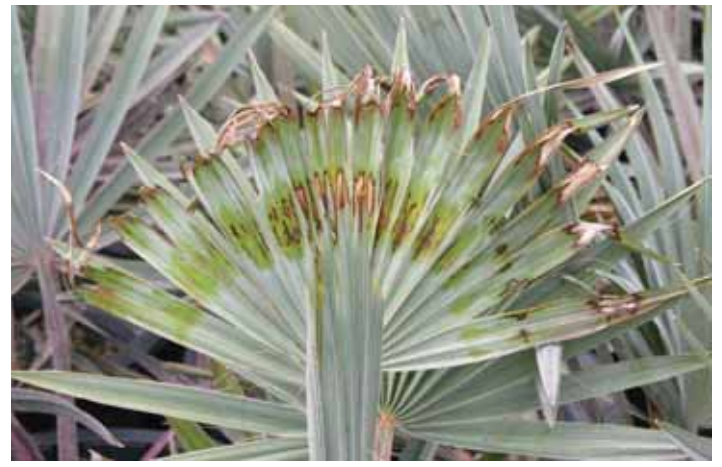
Figure 3. Boron deficiency of Bismarckia nobilis (Bismarck palm) showing necrosis at two separate times during the development of this leaf.

leaves may be visible at the apex of the canopy (Figures 5 and 6).