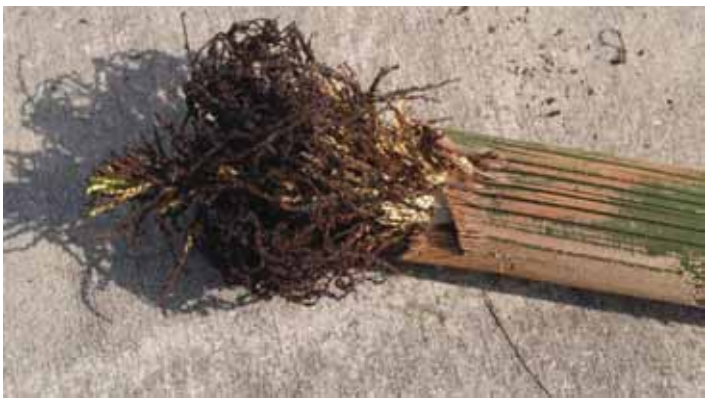
Figure 12. Necrotic inflorescence (flower stalk) of Syagrus romanzoffiana caused by B deficiency.