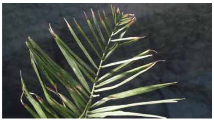
Figure 2. Leaf tip of B-deficient Phoenix roebelenii (pygmy date palm) showing necrotic truncation in an inverted V-shape. Credits: T. K. Broschat, UF/IFAS

Boron deficiency can be very transient in nature, often affecting a developing leaf primordium for a very short period of time (e.g., 1 to 2 days). This temporary shortage of B can cause necrosis (dead tissue) on the primordial spear leaf for a distance of about 1 to 2 cm. When such leaves eventually expand, this "point" necrosis affects the tips of all leaflets intersected by that necrotic point, the net result being the appearance of a blunt, triangular truncation of the leaf tip (Figures 2 and 3). This pattern can be repeated as many as three times during the development of a single leaf of Cocos nucifera (about 5 weeks) (Figure 4).