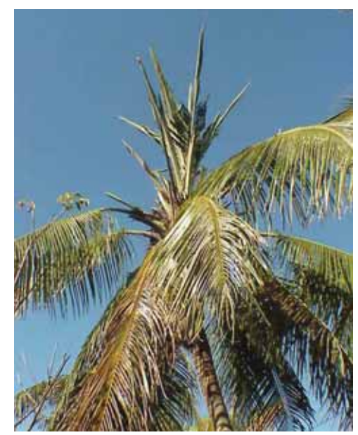
Figure 5. Multiple unopened spear leaves on a chronically B-deficient Cocos nucifera .

Perhaps the most unusual symptoms of chronic B deficiency is the tendency for the entire crown to bend in one direction (Figures 7 and 8). This is one form of epinasty that can also cause twisting of petioles and leaves or sharp bends in the petiole, resulting in a single new leaf growing downward along the trunk (Figure 9). These epinastic symptoms are believed to be caused by a B deficiency-induced decrease in IAA-oxidase activity and therefore excessive auxin concentrations within the leaves.