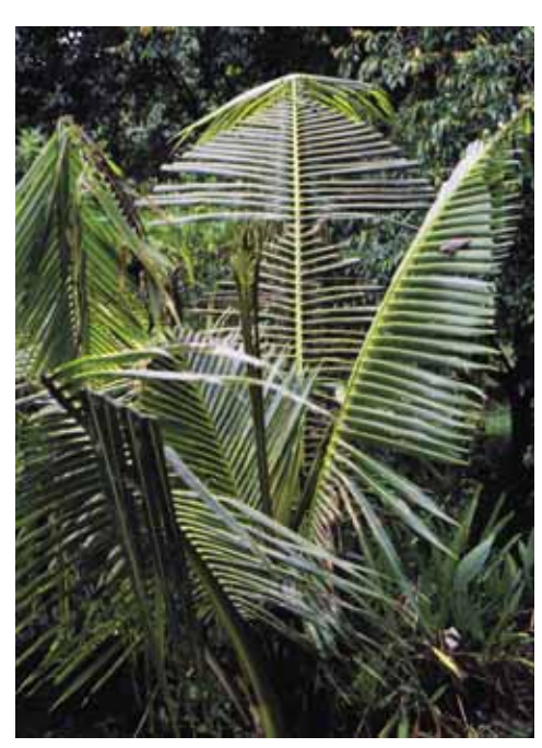
Figure 4. Boron-deficient Cocos nucifera showing a series of inverted V-shaped truncations on each leaf. These leaf constrictions represent separate temporary B deficiencies caused by a series of heavy rainfalls.

Perhaps the most unusual symptoms of chronic B deficiency is the tendency for the entire crown to bend in one direction (Figures 7 and 8). This is one form of epinasty that can also cause twisting of petioles and leaves or sharp bends in the petiole, resulting in a single new leaf growing downward along the trunk (Figure 9). These epinastic symptoms are believed to be caused by a B deficiency-induced decrease in IAA-oxidase activity and therefore excessive auxin concentrations within the leaves.