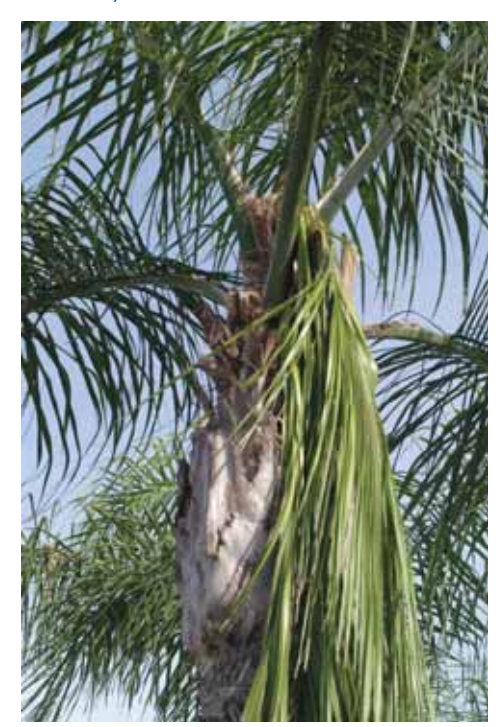
Figure 9. Bent new leaf of Syagrus romanzoffiana caused by B deficiency.

Boron deficiency in its acute form produces yet other symptoms. Often leaves emerge greatly reduced in size and crumpled in a corrugated fashion (accordion leaf) (Figures 10 and 11). Palms often grow out of these symptoms, but the deficiency may kill the meristem.