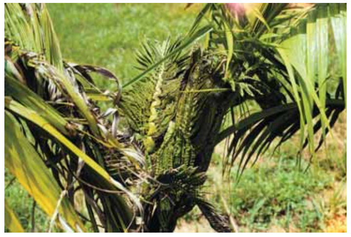
Figure 11. Acute B deficiency in Heterospathe elata (sagisi palm) showing small crumpled new leaves.