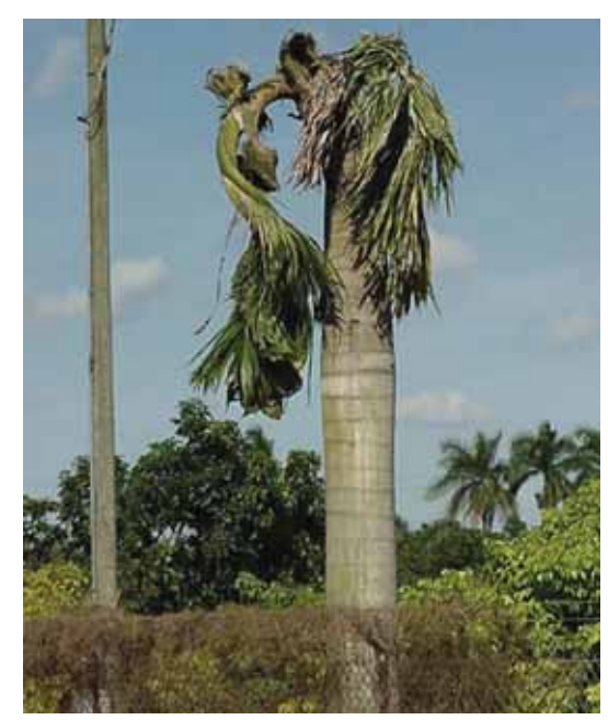
Figure 8. Severe epinasty in Roystonea regia (Cuban royal palm) due to B deficiency. Note also the small size of some of the leaves.