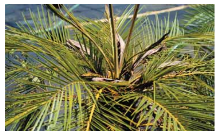
Figure 6. Mulitple unopened spear leaves on B-deficient Phoenix roebelenii .