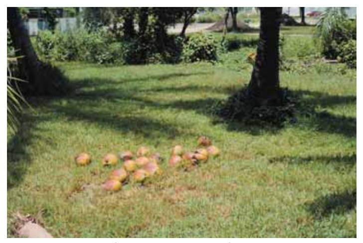
Figure 13. Premature fruit drop in Cocos nucifera caused by B deficiency.