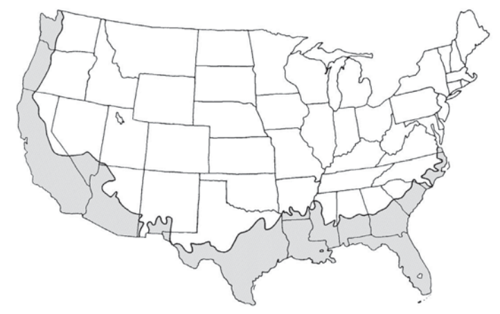
Figure 2. Range

Uses: specimen; screen; hedge; fruit Availability: not native to North America