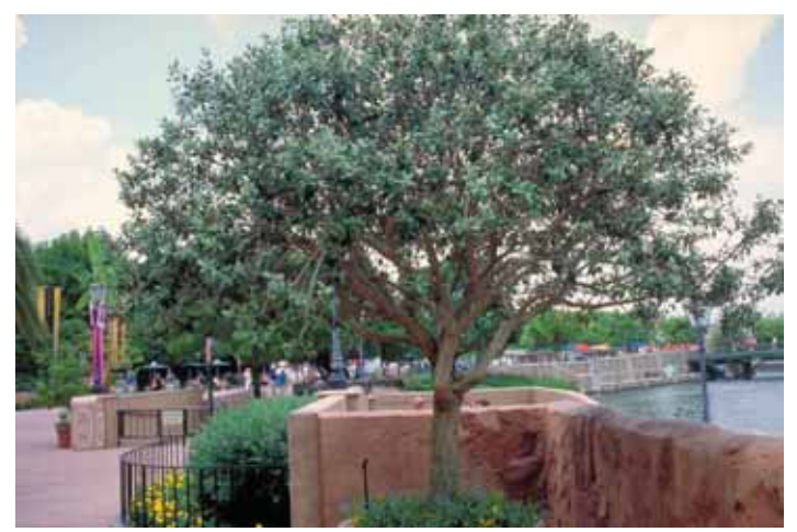
Figure 1. Young Feijoa sellowiana : Feijoa Credits: Ed Gilman

Feijoa sellowiana , or Pineapple Guava, is a gray-green evergreen shrub or tree (depending on pruning) which produces small, tasty fruit in late summer and early fall. The plants can be pruned to form a hedge or a small tree and will withstand several degrees below freezing. It is native to South America. The plant is not used nor is it commonly available in the eastern U.S.