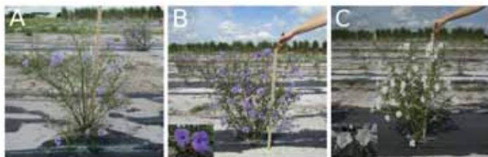
Figure 3. The resident species, Ruellia simplex (A), and the two cultivars, Mayan Purple (R10-102; B) and Mayan White (R10-108; C), that were approved by the Invasive Plant Working Group after evaluation using the Intraspecific Taxon Protocol. UF/IFAS approved these two cultivars for recommendation because of their sterility and distinctiveness from the resident species.