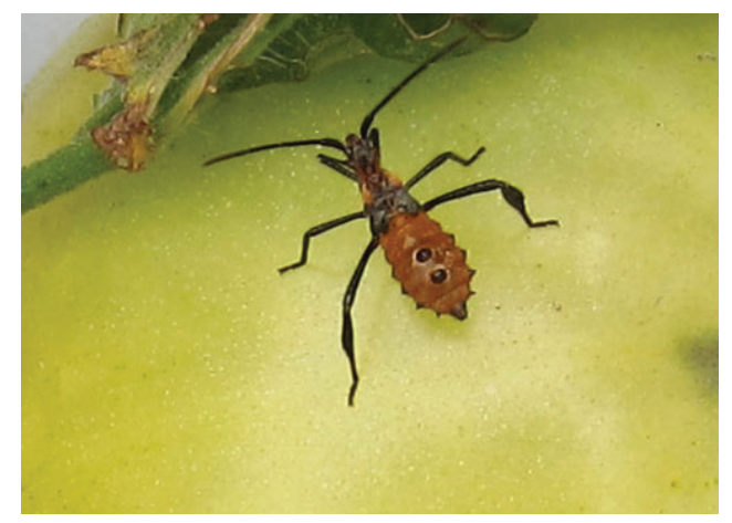
Figure 4. Nymph of the western leaffooted bug, Leptoglossus zonatus (Dallas).

There are five wingless nymphal instars. Nymphs mostly have black legs, while their bodies range in color from orange to reddish brown. The leaf-like hind tibia, a common defining characteristic of the family Coreidae, does not develop in the early instars. It develops during the latter instars along with the change to adult coloration.