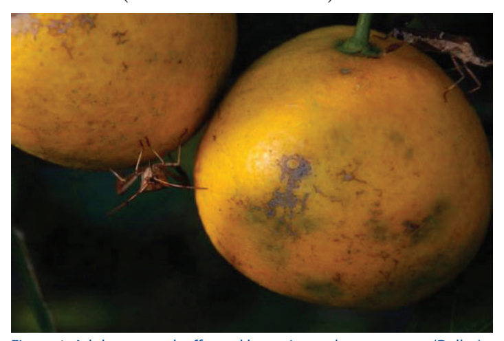
Figure 1. Adult western leaffooted bugs, Leptoglossus zonatus (Dallas), on citrus fruit.

Leptoglossus zonatus (Dallas) is widely known as the western leaffooted bug, but this is not an approved common name. Leptoglossus zonatus is a prevalent polyphagous minor pest of various field, vegetable and fruit crops in the Gulf Coast region of the United States. It has become a key pest in citrus, especially of satsuma mandarin (Citrus unshiu Mar.). It is also considered an important emerging pest on a wide range of crops including corn, cotton, eggplant, peach, pecan, pomegranate, tomato, and watermelon in the United States (Xiao and Fadamiro 2011).