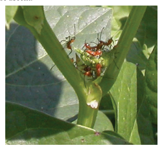
Figure 5. Aggregation of nymphs of the western leaffooted bug, Leptoglossus zonatus (Dallas).

Weed management is a basic agronomic practice used to suppress pest infestations. For instance, a potential tool is removal of Spathodea campanulata , "flame of the forest," which serves as an alternate host for L. zonatus when tree fruit are absent.