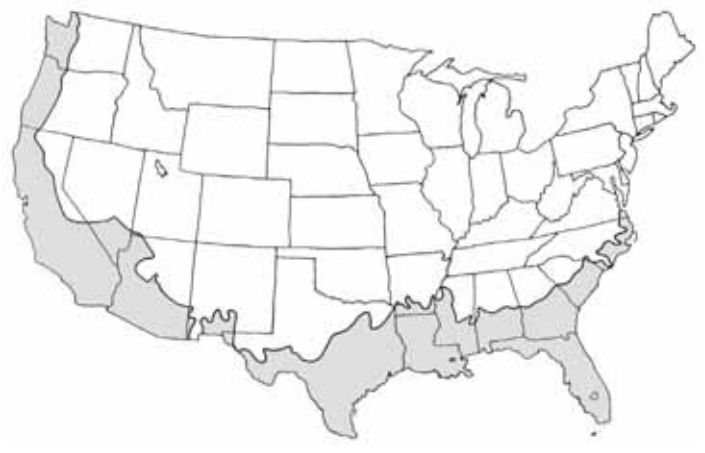
Figure 2. Range Foliage