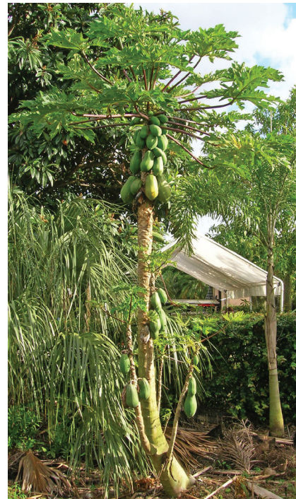
Figure 2. Papaya plant in the home landscape.

Roots of mature papaya trees spread beyond the drip-line of the tree canopy and heavy fertilization of the lawn adjacent to papaya trees is not recommended because it may reduce fruiting and or fruit quality. The use of lawn sprinkler systems on a timer may result in over watering and cause papaya trees to decline. This is because too much water too often applied causes root rot.