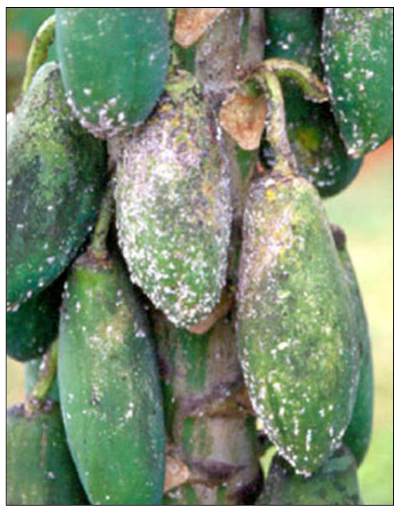
Figure 7. Papaya fruit infestation and damage caused by the papaya mealybug, Paracoccus marginatus Williams and Granara de Willink.

fruit and stem. In doing so, it injects a toxic substance into the leaves. The result is chlorosis, plant stunting, leaf deformation, early leaf and fruit drop, a heavy buildup of honeydew, and death. Heavy infestations are capable of rendering fruit inedible due to the buildup of thick white wax. Papaya mealybug has only been recorded feeding on areas of the host plant that are above ground, namely the leaves and fruit.