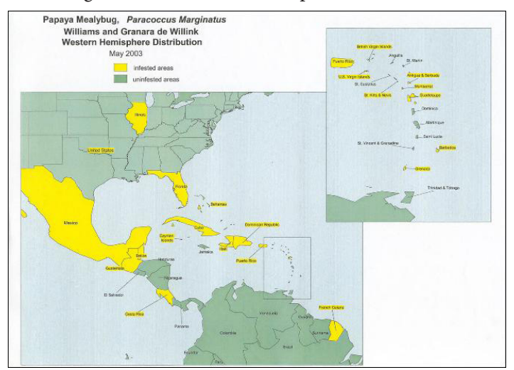
Figure 2. Distribution of the papaya mealybug, Paracoccus marginatus Williams and Granara de Willink, as of May 2003.

Martin, Guadeloupe, St. Barthelemy, Antigua, Bahamas, British Virgin Islands, Cuba, Dominican Republic, Haiti, Puerto Rico, Montserrat, Nevis, St. Kitts, and the US Virgin Islands. More recently, specimens have turned up in the Pacific regions of Guam and the Republic of Palau.