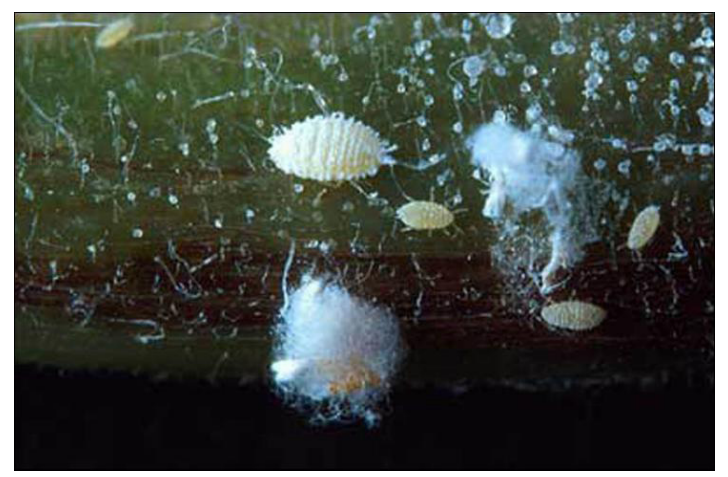
Figure 1. Adults and egg sacs of papaya mealybug, Paracoccus marginatus Williams and Granara de Willink.

The papaya mealybug, Paracoccus marginatus Williams and Granara de Willink, is a small hemipteran that attacks