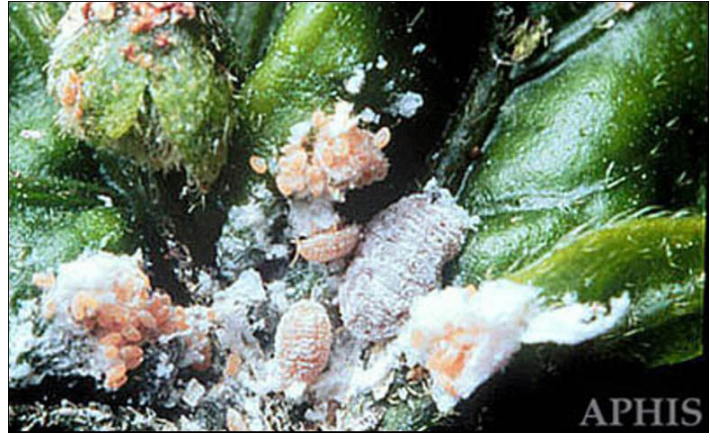
Figure 6. Various stages in the life cycle of the pink hibiscus mealybug, Maconellicoccus hirsutus (Green).

Miller and Miller (2002) give a complete description of all instars of both sexes of the papaya mealybug, as well as a complete description of characters used to distinguish the papaya mealybug from other closely related species.