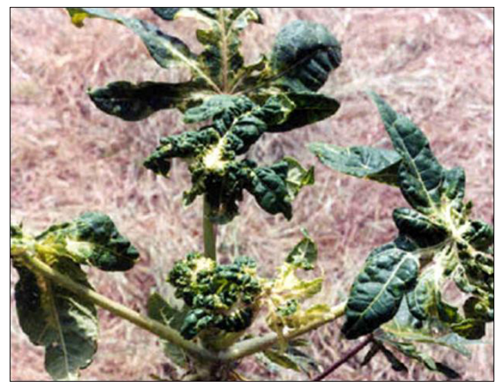
Figure 8. Papaya leaf deformation caused by the papaya mealybug, Paracoccus marginatus Williams and Granara de Willink.