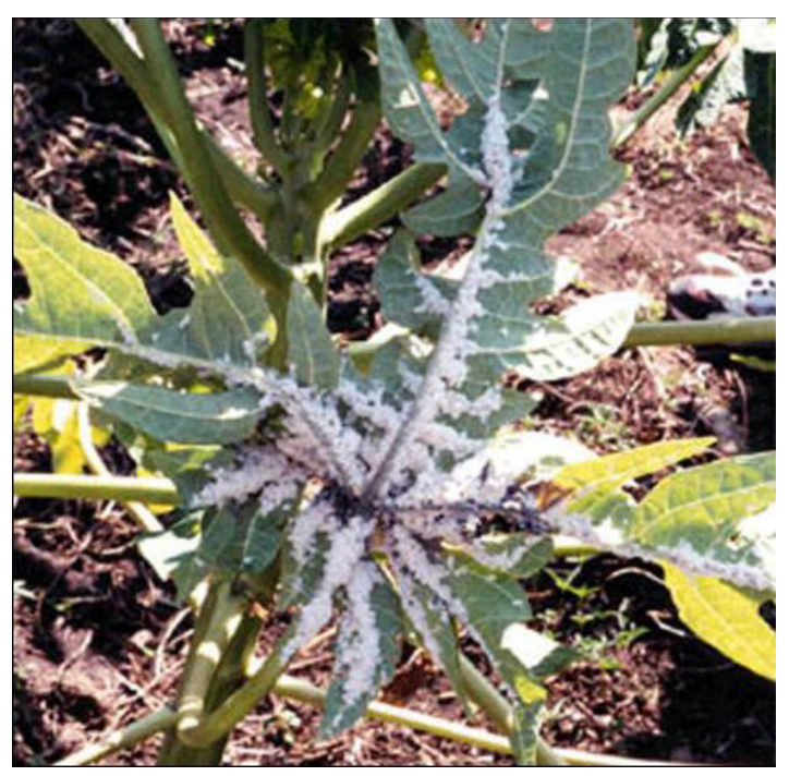
Figure 3. Papaya leaf infestation of the papaya mealybug, Paracoccus marginatus Williams and Granara de Willink.

Eggs are greenish yellow and are laid in an egg sac that is three to four times the body length and entirely covered with white wax. The ovisac is developed ventrally on the adult female.