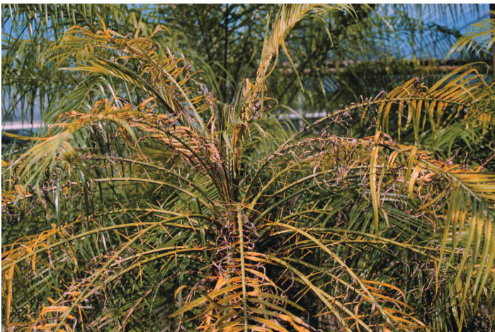
Figure 6. Manganese deficiency on pygmy date palm. Note curling or frizzling of leaflets towards the base of the le