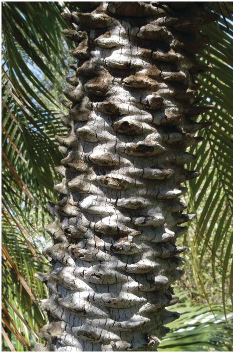
Figure 2. Trunk of pygmy date palm