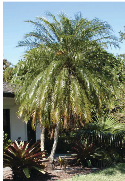
Figure 1. Pygmy date palm

a fully round crown has been achieved, visible symptoms of K deficiency will also begin to disappear. Landscape palm fertilizers should have an analysis of 8-2-12 (or 8-0-12) with 100% of the nitrogen (N), K, and magnesium (Mg) in controlled release form, and micronutrients such as manganese (Mn) and iron (Fe) in water soluble (sulfate or chelate) form in order to be effective. For more information about K deficiency and fertilization of landscape palms in Florida, see EDIS publications EP269 and EP261 .