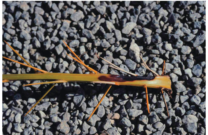
Figure 9. Pestalotiopsis leaf spot on pygmy date palm

Pygmy date palms are occasionally damaged by mites and insects such as mealybugs, scales, weevils, and caterpillars. Young leaves of pygmy date palms are normally covered with a whitish material (Figure. 10) that is often mistaken for a whitefly, mealybug, or scale infestation. This material drops off naturally as the leaves age.