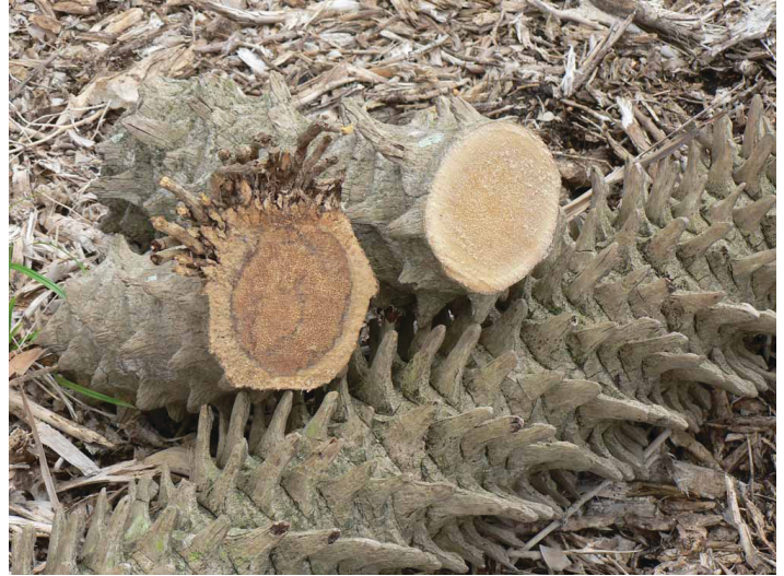
Figure 8. Ganoderma butt rot of pygmy date palm showing discoloration of decayed trunk on left and healthy trunk on right

the trunk (Figure 8). There is no control for this disease. Another common disease, particularly during cooler months, is Pestalotiopsis leaf spot, which causes necrotic lesions on the leaflets, rachis, and petioles (Figure 9). In severe cases, this disease can kill the palm.