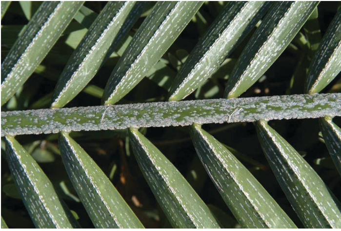
Figure 10. Naturally occurring whitish material on young leaf of pygmy date palm