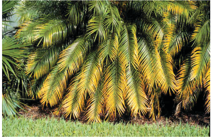
Figure 4. Magnesium deficiency on pygmy date palms Credits: T. Broschat