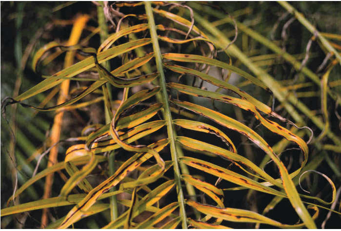
Figure 5. Manganese deficiency on pygmy date palm showing necrotic streaking on leaflets