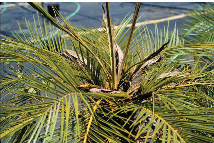
Figure 7. Boron-deficient pygmy date palm showing multiple unopened spear leaves

Pygmy date palms are relatively resistant to diseases, but two diseases are fairly common in this species. Ganoderma butt rot, a soil-borne fungal disease caused by Ganoderma zonatum , causes decay in the bottom couple of feet of