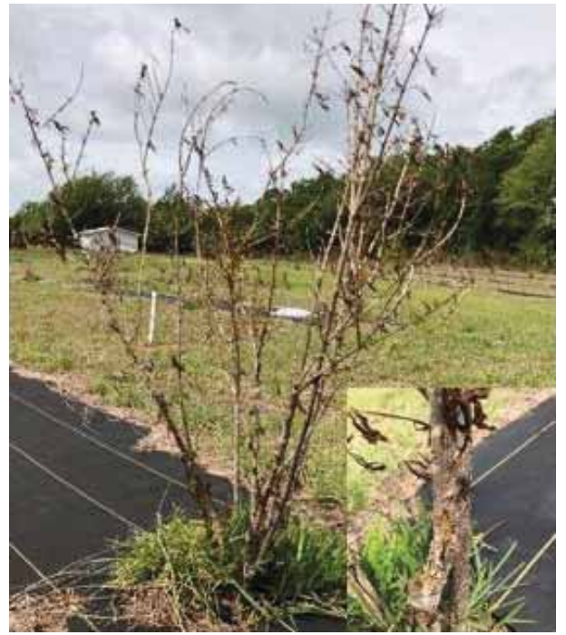
Figure 3. Late freeze damage (28°F) to a non-dormant tree in Cross City FL, March 2018.

Pomegranate is an attractive ornamental plant and there are some varieties available for ornamental purposes, which do not produce fruit (Figure 4).