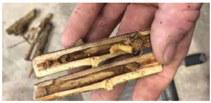
Figure 16. Damage by flat-headed borer to pomegranate tree in Cross City, FL.

Scale and mites occasionally attack the plant, but these do little damage. Sulfur dust applied in early June offers good mite control. Scale insects can be controlled by an application of 3% oil spray during the winter when the leaves are not present. Tree borers can also infest and kill trees (Figure 16).