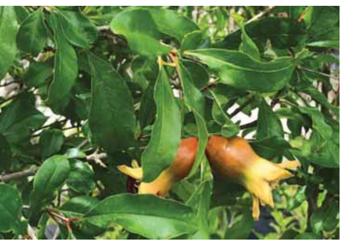
Figure 5. Pomegranate leaves and young fruit.

Blooms are a flaming orange-red, 1.5–2.5 in (4–6 cm) in diameter with crinkled petals and numerous stamens. Flowers are borne solitary or in small clusters angled towards the end of branchlets. Flowers are 'perfect', containing both male and female parts; however, pomegranate trees generally carry two types of flowers; namely female (productive, Figure 6) or male (non-productive, Figure 7). In male flowers, the pistils are not developed as in female flowers and they do not produce fruit. Flowers are generally self-pollinated.