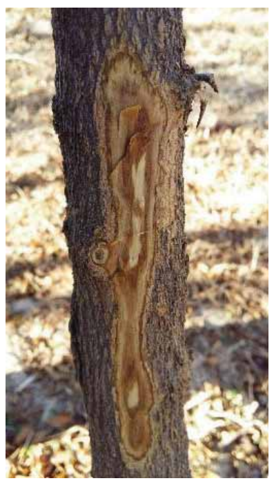
Figure 2. Freezing damage (12°F) to a dormant tree.