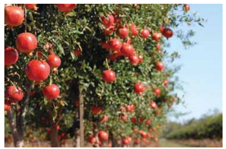
Figure 1. Pomegranate tree (Wonderful cv.).