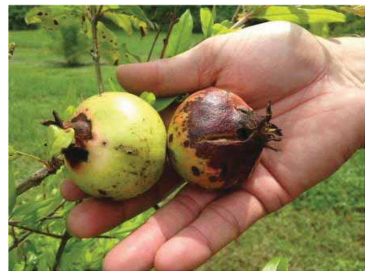
Figure 15. Anthracnose caused by Colletotrichum sp. to pomegranate fruit.

The most destructive disease observed in Florida is anthracnose caused by Colletotrichum sp. (Figure 15). It can affect leaves, stems, flowers, and fruit. Leaf symptoms include small, circular to angular, dark, reddish-brown to black areas, 0.25 in (4-5 mm) in diameter. Infected leaves are pale green and fall prematurely. Fruit symptoms are small, conspicuous, dark brown spots, initially circular, becoming irregular. At least three sprays per year of neutral copper fungicide can reduce the disease impact.