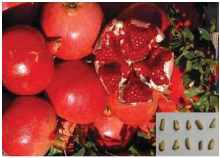
Figure 8. Pomegranate fruit, aril, and seed.