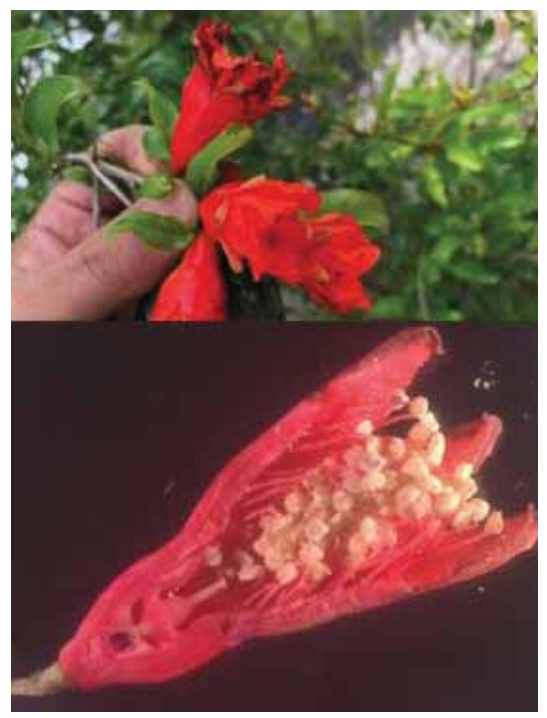
Figure 7. Male flower (non-productive flower).