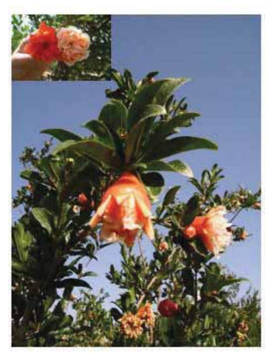
Figure 4. Ornamental pomegranate.

Pomegranate leaves are glossy, dark green, oblong to oval, and 1–1.25 in. (2.5–3 cm) long. Leaves are arranged opposed and pairs alternately crossing at right angles and clustered on short branchlets (Figure 5).