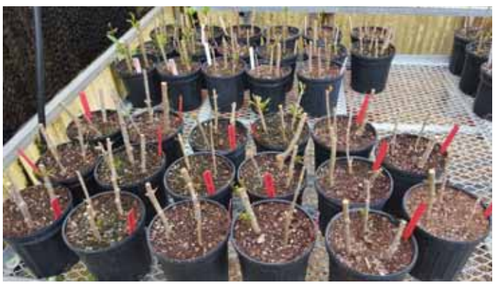
Figure 11. Hardwood propagation.

Trees are easily propagated during winter from hardwood cuttings 6-8 in (15-20 cm) in length and pencil size or larger in diameter (Figure 11). In Florida, hardwood cuttings should be taken in January or February and placed vertically in soil with the 2-4 top nodes exposed. Cuttings may be left in nursery rows for 1 to 2 years. Seed-propagated plants do not come true-to-type, but seeds will germinate in 45-60 days. Layering is also successful but more labor-intensive.