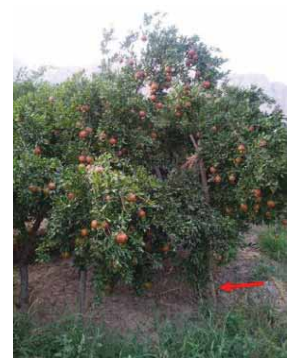
Figure 14. Pomegranate tree branch supported due to heavy fruiting.

Pomegranate trees are self-pollinating. Severe fruit drop during the plant's juvenile period (3–5 years) is not uncommon. Fruit drop is aggravated by practices favoring vegetative growth, such as over-fertilization and excess irrigation. Avoid putting young trees under stressful conditions. Fruit drop is less severe on mature trees than on younger trees.