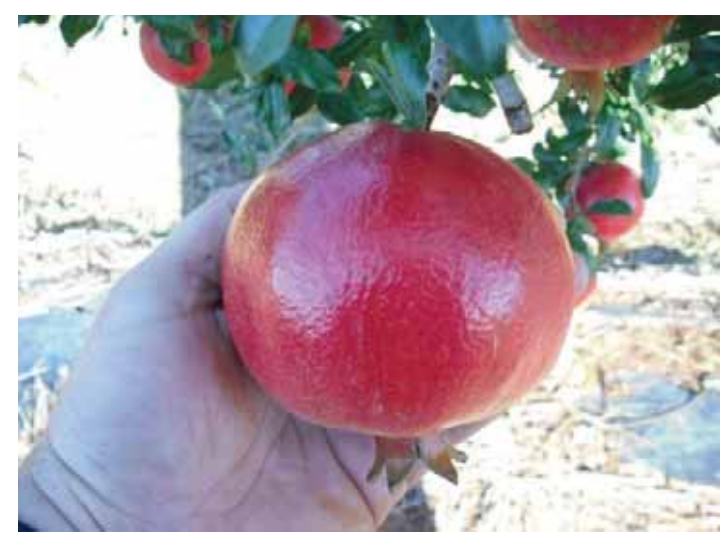
Figure 9. The 'Wonderful' pomegranate variety.

'Wonderful' cultivar (Figure 9) is grown commercially in California from cuttings from Florida. Florida's wet season, accompanied by hot weather, are factors that reduce the fruit quality of late-season fruiting of pomegranate varieties such as 'Wonderful'. Therefore, the late-ripening 'Wonderful' variety might not be the suitable cultivar for Florida. Also, earlier-ripening cultivars that mature in July and August will avoid marketing competition with California pomegranates. However, the economic potential for growing pomegranate trees commercially in Florida is currently unknown at this time.