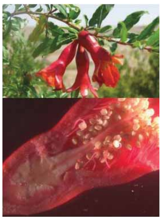
Figure 6. Female flower (productive flower).

calyx (Figure 8). The calyx may be 1.5-2.5 in (1-6 cm) long. Numerous seeds are each surrounded by a pink to purplishred, juicy, sub-acid pulp (aril), which is the edible portion. The pulp is somewhat astringent. Pomegranates grown in North Florida mature from July to November, but may produce year-round in South Florida.