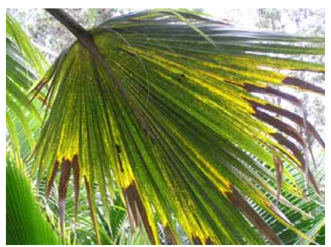
Scorched leaf tips, brown necrotic lesions, and chlorosis on this Pritchardia palm are easily identifiable traits of K^{\star} deficiency.

Advanced symptoms include a reduced canopy size and smaller trunk diameter, also known as pencil-point-