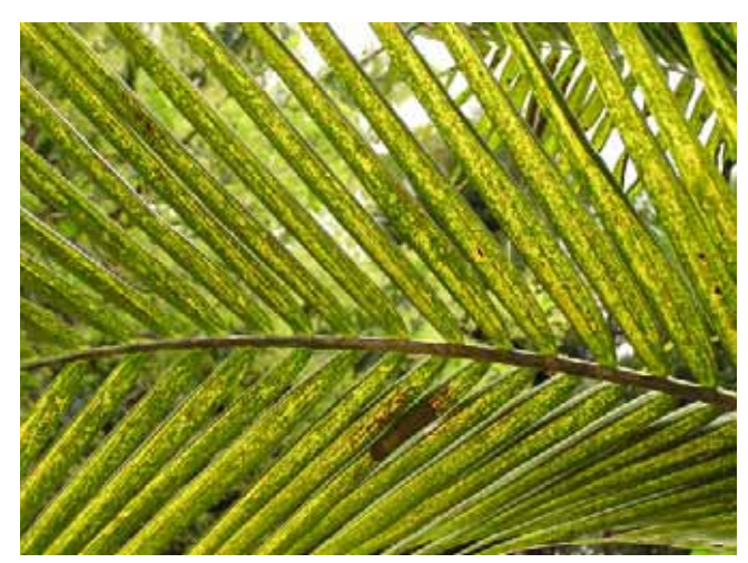
Chlorotic and necrotic speckling occur on coconut leaflets with potassium deficiency.

released from soil particles, it is available to plants and can be taken up by their roots.