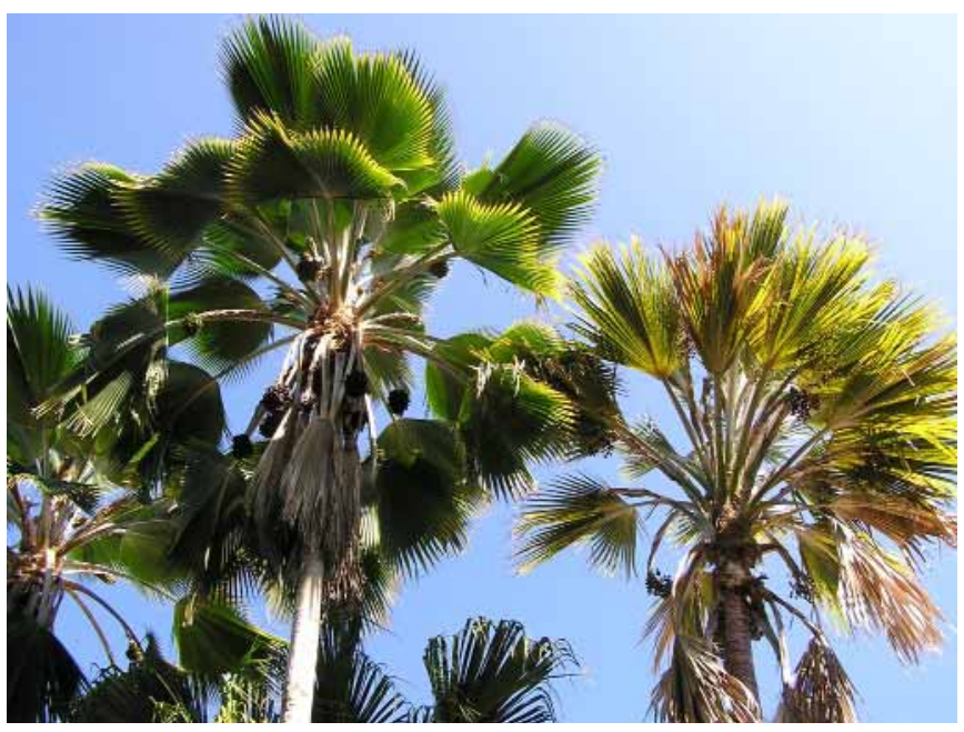
Early or mild symptoms of potassium deficiency of Pritchardia palm (left) include slightly scorched leaf tips. More severe symptoms of potassium deficiency of Pritchardia palm (right) include leaves with chlorotic speckling, pronounced necrosis, and unthrifty growth.