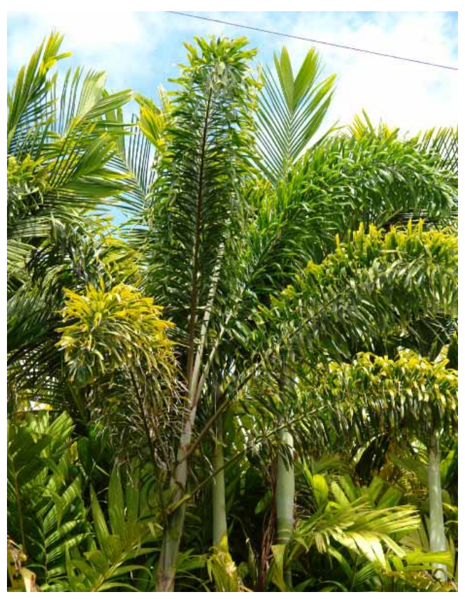
A potassium-deficient palm has scorched leaves in the lower canopy.

Apply a slow-release fertilizer formulated for palms every four months. Palm fertilizers usually appear in Nitrogen-Phosphorus-Potassium (N-P-K) ratios such as 3:1:2, 2:1:3, or 3:1:3. For small palms (i.e., pygmy date palms, European fan palms, etc.), use \frac{1}{2} -2 lbs (0.22-0.9 kg) per application. For medium palms (true date palms, queen palms, etc.), use 3–4 lbs (1.4–1.8 kg) per application. For large palms (i.e., royal palms, reclinata hybrids), use 5–7 lbs (2.3–3.2 kg) per application. Apply the fertilizer to the soil surface in a band at the interface between the root ball and existing soil or at the drip line. Slow-release fertilizer works best when scratched into the soil surface. Fertilizers containing micronutrients can stain concrete, so use caution when applying them. Products for organic growers include Espoma's