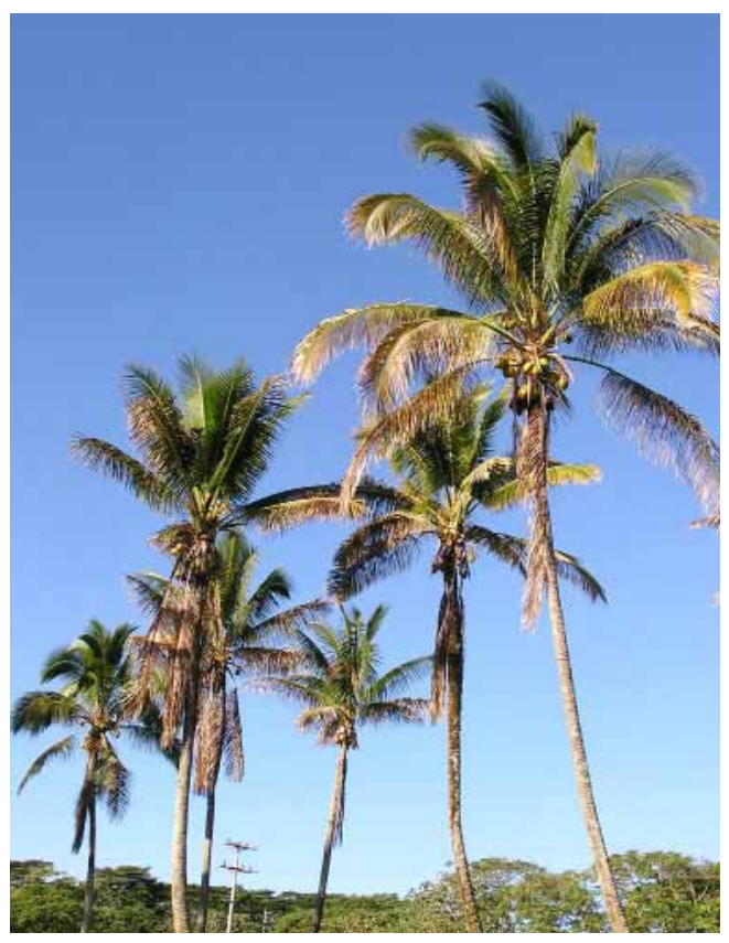
Symptoms of potassium deficiency of coconut include brown and yellow discoloration and drooping of older, lower leaves.