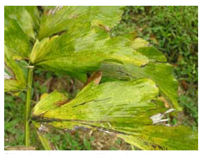
Chlorotic and necrotic speckling and mosaic occur on the leaflets of a fishtail palm with early symptoms of potassium deficiency in a Hawai'i landscape. The symptoms can progress to a more severe stage, resulting in leaf spots, distortion, and necrosis.