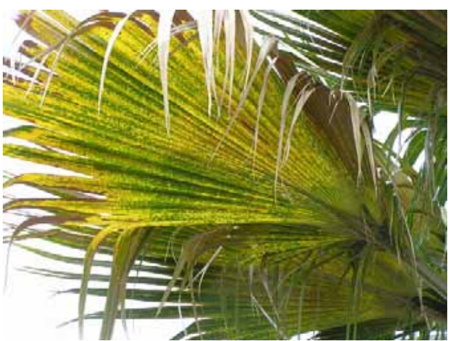
In advanced stages of severe potassium deficiency, leaves of Pritchardia palm have scorched tips and chlorotic speckling.

tions, making the K<sup>+</sup> less available to plants.