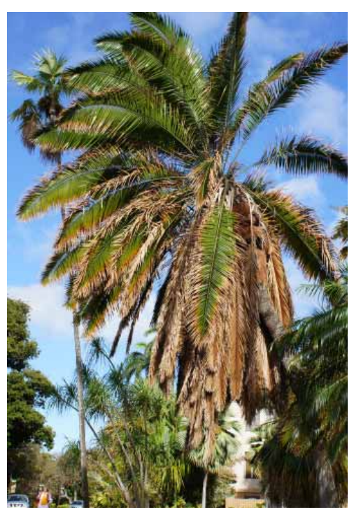
Scorched tips of leaflets on the lower leaves of this Sabal palmetto (cabbage palm) are diagnostic symptoms of potassium deficiency.

Deficiency diseases are not infectious, but unless managed properly the symptoms can mar landscapes, prevent the sale of potted palms, reduce coconut yield, and eventually cause plant death. Here we discuss a common nutrient deficiency disease of palms in Hawai'i: the lack of potassium. We illustrate the typical symptoms of this disease and suggest practices that may be combined to prevent or treat it.