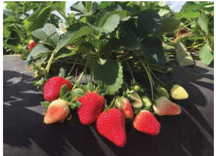
Figure 1. 'Florida Brilliance' on a commercial farm near Plant City, Florida in late February 2018.

'Florida Brilliance' is so named for its attractive fruit, which are glossy and conical in shape (Figure 1). The gloss of the fruit is accentuated by the position of the achenes which are recessed below the fruit surface, creating curvatures that reflect light in many directions. This cultivar maintains a very consistent shape and does not produce any elongated fruit early in the season, which is a weakness of 'Florida Radiance' in Florida.