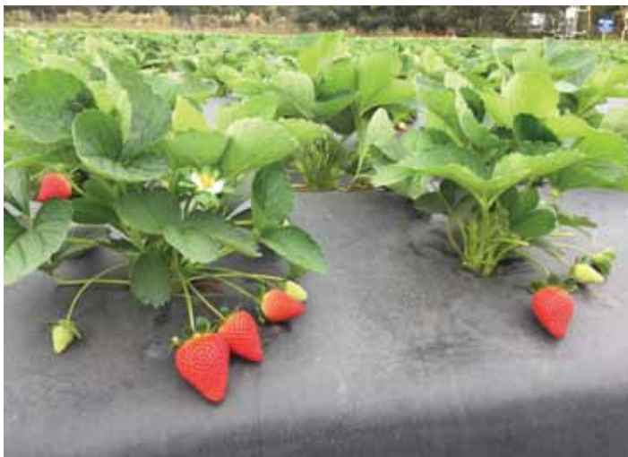
Figure 2. Plants and fruit of ‘Florida Brilliance’ at the Florida Strawberry Growers Association in Dover, Florida in December 2016.

The fruit of ‘Florida Brilliance’ are firmer than other University of Florida cultivars, with excellent shelf life and juicy texture. The soluble solids content (°Brix) of the fruit in central Florida ranges from 6%–9%, depending on the harvest date, which is similar to ‘Florida Radiance’ and slightly lower than ‘Florida Beauty’ and ‘Florida127’. The titratable acidity is similar to or slightly lower than ‘Florida Radiance’, depending on the harvest date. Thus, its flavor has been rated slightly better than ‘Florida Radiance’ on some harvest dates, with slightly higher sweetness and lower sourness. The average fruit size of ‘Florida Brilliance’ is approximately 20 grams, which is larger than ‘Florida Radiance’ but not as large as ‘Florida127’. It also is very efficient to harvest due to its open yet robust plant and long stems (Figure 2).