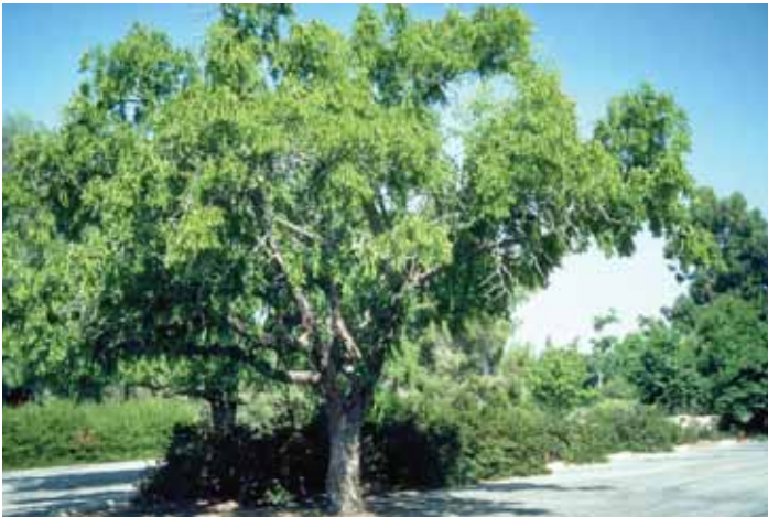
Figure 1. Young Ziziphus jujuba : Chinese Date

Availability: somewhat available, may have to go out of the region to find the tree