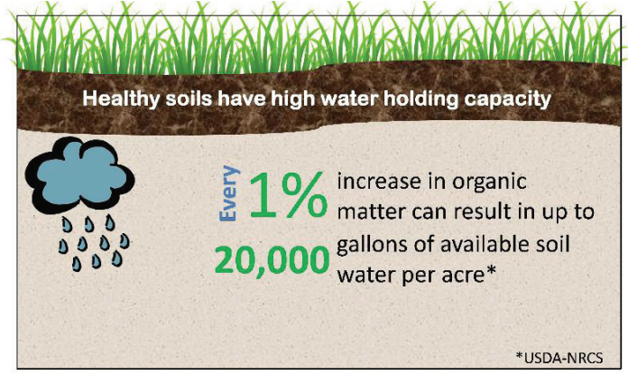
Figure 1. Healthy soils with high organic matter will equate to higher water holding capacity.

Farming in Florida on sandy soils has a wide range of limiting factors, including nutrient deficiencies, acidity, poor physical attributes, and low water storage. The soils are characterized by their particle size, typically having low clay content, and being dominated by coarse particles. This coarse or sandy texture confers certain physical properties on the soils that influence the ability of the soil to hold water. In terms of WHC, sandy soils of Florida have larger pores than finer textured soils, making it more difficult to hold soil water against gravity; consequently, sandy soils have a lower capacity to store soil water for plant uptake. To plants, soil OM is a source of nutrients that also supports biological and physical characteristics (such as improved WHC); to farmers, it is a currency of exchange. By adopting farming methods that increase soil OM, Florida growers can increase the WHC of their soils. According to the USDA-NRCS, the most conservative estimates suggest that every 1% increase in soil OM will help soils hold up to 20,000 gallons more water per acre (Bryant 2015) (Figure 1). This would mean savings in energy cost associated with farming practices that depend on pump irrigation, and, for growers that depend on rain-fed irrigation, would equate to more "savings" in operating expenditure.