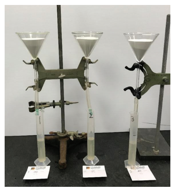
Figure 3. Laboratory experimental setup for measuring maximum water holding capacity.

Results indicated that there was a steady increase in WHC with every 1% increase in OM content for both sandy soils and limerock (Figure 4). Based on our study, every 1% increase of OM equates to a 2.3% and a 1.3% increase in soil WHC for sand and limerock, respectively. This would equate to an average of 10 gallons of water stored per acre-foot on sandy soils and 9.1 gallons of water stored per acre-foot of limerock if OM content were to be increased by 1%.