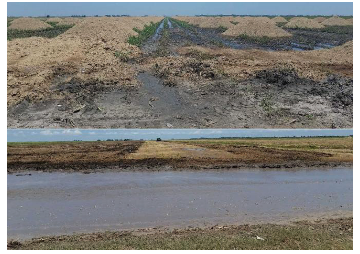
Figure 2. Bagasse being applied as organic soil amendment on sandy soils in south Florida.

converted into biofuels and other products. Utilizing locally derived crop residues such as bagasse (Figure 2), rice hulls, and palm fronds as soil amendments on sandy soils can potentially increase soil OM. Leaving this residue on the soil to naturally break down provides additional carbon to feed the soil. Gould (2015) showed that the application of compost increased water holding capacity of droughty soils.