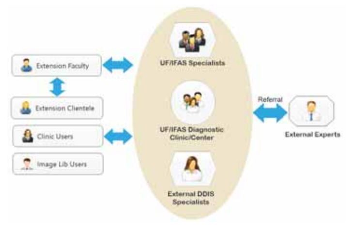
Figure 2. Collaboration among DDIS users and diagnostic clinics or specialists. Credits: Jiannong Xin, UF/IFAS