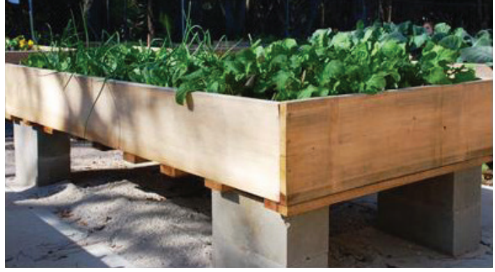
Figure 1. Example of an elevated raised bed ideal for individuals in wheel chairs or for those who cannot bend over.

Raised beds offer many advantages. Traditional gardening takes a toll on knees and backs, whereas gardening in raised beds helps save the joints (Figure 1). Many gardeners cannot grow vegetables in traditional gardens because soils are poor, too wet, compacted, or plagued with nematodes and other soilborne pests. Raised beds allow you to control the soil to avoid these issues. Another plus is that soils aboveground heat up more quickly so you can get a jump on the spring gardening season. Also, raised beds are typically more productive than in-ground vegetable gardens because the planting medium is easier to improve and there is no wasted space for walkways between rows.