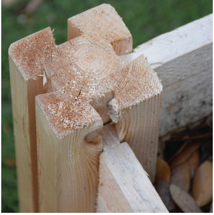
Figure 4. Example of corner post with grooves that allow 2" wood sides to slide in which makes it easy to construct and dismantle.

long sides). Purchase ninety 3" long deck screws. Stainless steel screws are preferred when using ACQ treated lumber. However, if you are on a limited budget, look for screws with a coated finish guaranteed not to corrode when used with ACQ treated lumber.