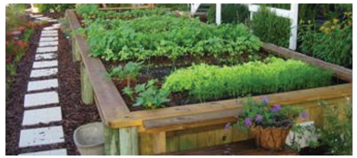
Figure 2. Raised beds can be elaborate and esthetically pleasing.

Next, determine the size and height of the raised bed. It should be no wider than 4' because most people can only comfortably reach 2' to the center. The length varies and depends on the site. A common size is 4' wide x 8' long x 16"–24" deep. The height really depends on the level that is most comfortable for you and the investment you want to make in materials. The site may lend itself to multiple beds but make sure to give yourself ample room between beds—about 18"–24". Beds can be various shapes (e.g., square, rectangle, L shaped, triangle). Raised beds can be basic or very elaborate and esthetically pleasing in the landscape (Figure 2).