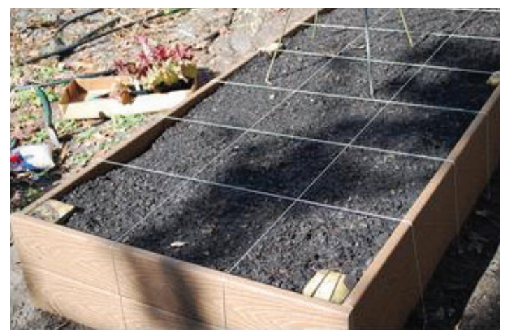
Figure 3. A raised bed using synthetic wood is more expensive than ACQ treated lumber but will last longer.

Options for building materials include stone, bricks, concrete blocks, synthetic/recycled materials, or wood. If using concrete, pre-cast concrete blocks are acceptable to use for creating raised beds for edibles. But if using poured-inplace concrete, there are potential problems associated with some of the curing compounds, stains and sealers that are sometimes used, and with the release agents typically used on the wood forms. Wood is the most common material and is relatively inexpensive, but untreated lumber starts to rot within a year. For longevity and cost effectiveness, use ACQ Ground Contact treated lumber, which is treated with new copper preservatives and approved by the Food and Drug Administration for food production. Cedar, redwood, and synthetic wood (Figure 3) are also durable, but they are more expensive than ACQ treated lumber. Avoid using railroad ties or old pressure-treated lumber purchased prior to 2004 for edibles because of the potential for food contamination from creosote and arsenic.