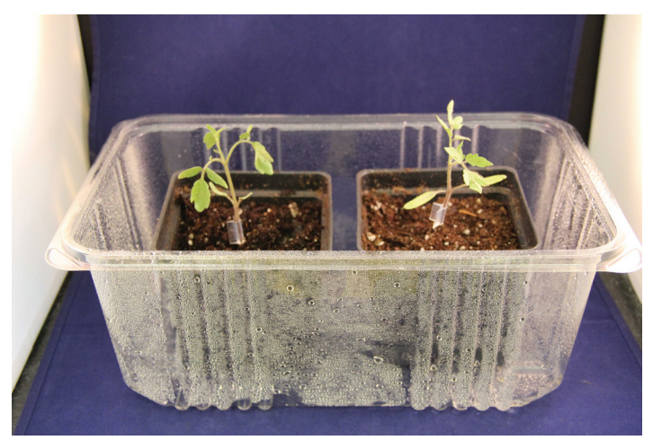
Figure 3. Grafted plants inside salad container.