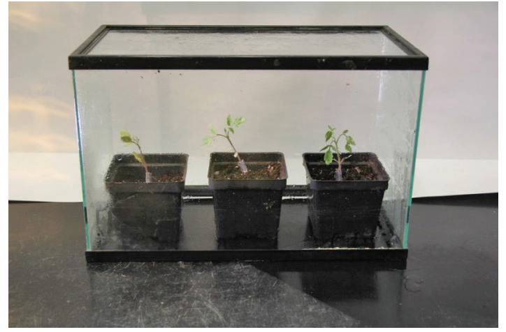
Figure 4. An upside-down aquarium used as a healing chamber.

An empty glass aquarium can provide the ideal environmental conditions for a healing chamber (Figure 4). One day before the grafting is performed, use a hand sprayer to mist water on the inside surfaces of the aquarium walls, and close it to raise the RH. Place the seedlings inside the aquarium, and close the lid. If an aquarium lid is not available, place the aquarium upside down over the seedlings.