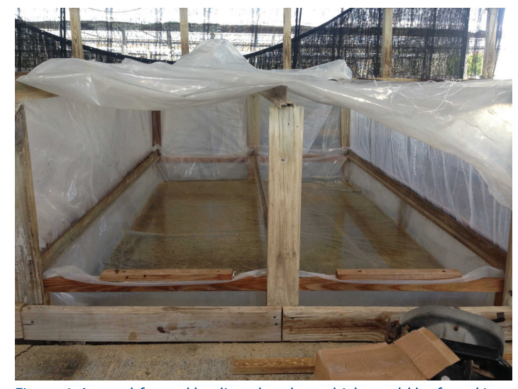
Figure 6. A wood-framed healing chamber, which would be found in a large-scale grafting operation.

For a large-scale grafting operation, healing chambers can be built inside a separate area of the greenhouse or over the transplant tray benches. Wood or PVC pipes can be used to build the chamber's frames and plastic can cover the structure (Figure 6). A pool of water can be maintained below the structure to provide high RH, eliminating the need to spray the surfaces of the chambers. The trays must be placed above the water level to avoid water saturation in the media. One day before grafting is performed, fill the water pool in the bottom of the chamber, and then close it to increase RH.