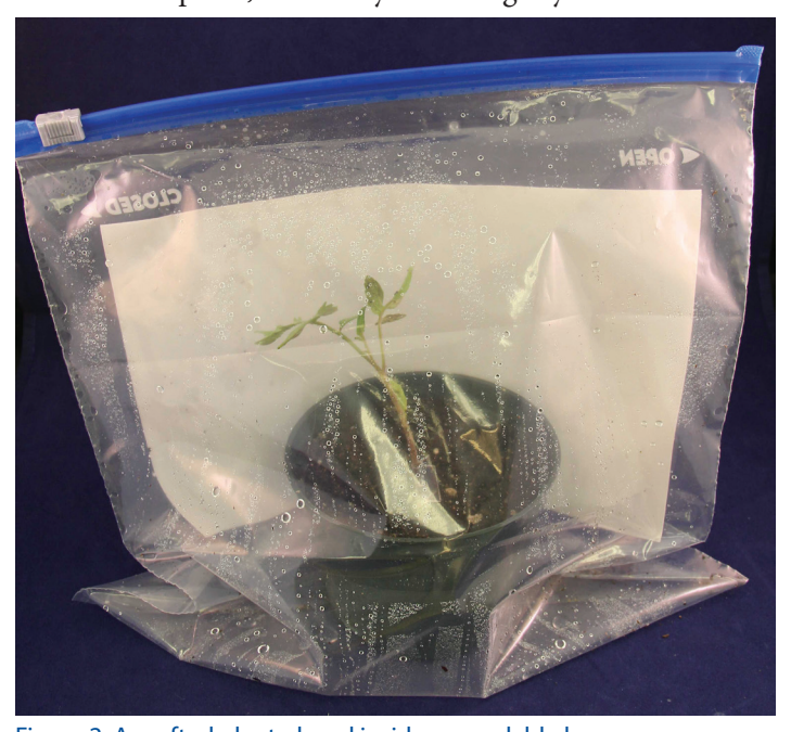
Figure 2. A grafted plant placed inside a resealable bag.

One day before the grafting is performed, mist water on the inside surfaces of an appropriate-sized plastic bag, using a hand sprayer, and close it. This practice ensures the RH will reach 95% before the grafted plants are placed inside the bags. After grafting, open the plastic bag, place the potted, grafted seedlings inside, and then immediately close the bag to avoid RH loss (Figure 2). If needed, mist more water inside the bag before placing the plants inside. In order to avoid humidity loss to the outside air, there must be enough space to tighten the bag. Resealable bags can be a convenient option, since they can be tightly closed.