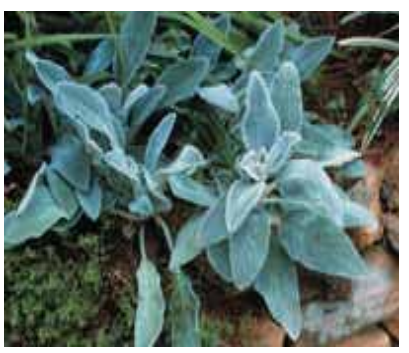
Stachys, or "Lamb's Ear"