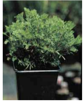
Artemisia abrotanum -Southernwood