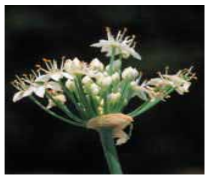
Garlic Chive flower