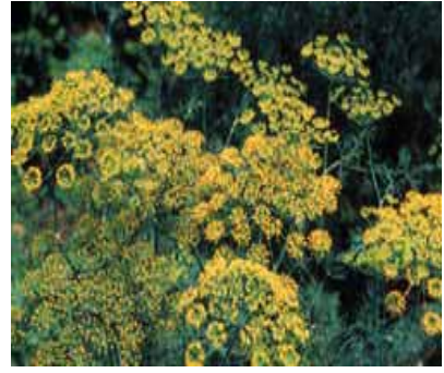
Dill in flower