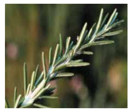
Sprig of Rosemary