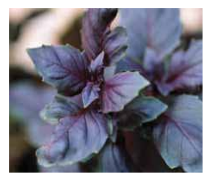
Basil 'Dark Opal'