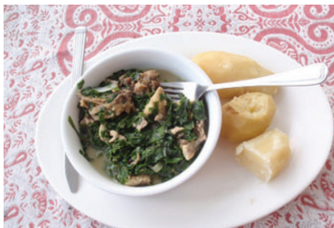
• Pele dish, Tonga

There has been some excellent research conducted, and information provided, on leafy vegetables in the Pacific (see Bibliography below). This 12 month project adds to this previous work in providing further information on levels of minerals, protein and carotenoids in a range of leafy vegetables collected in Samoa, Solomon Islands, Tonga, Torres Strait Islands and Queensland, growing on different soils. Nutritional analysis was carried out on species which were growing together on the same soil and across different sites. In addition to this introductory factsheet, 11 factsheets have been produced: one describes an exciting horticultural demonstration initiative on Thursday Island in the Torres Strait, and the other 10 feature the most nutritious leafy vegetables identified during this project...and they all taste good as well! Although not featured on factsheets, other leafy greens gave good results for the various nutrients, including sweetpotato leaves, cassava leaves, edible/sweet fern, watercress and various fig/ "sandpaper cabbage" leaves. Information on these will appear in the final report.