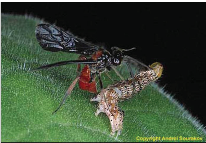
Figure 6. The wasp parasitoid Cardiochiles nigriceps Viereck, stinging a larva of a tobacco budworm, Heliothis virescens (Fabricius).