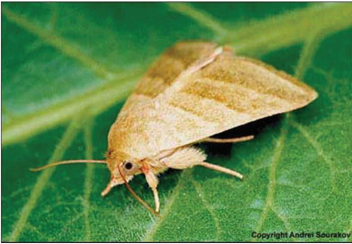
Figure 4. An adult tobacco budworm, Heliiothis virescens (Fabricius).