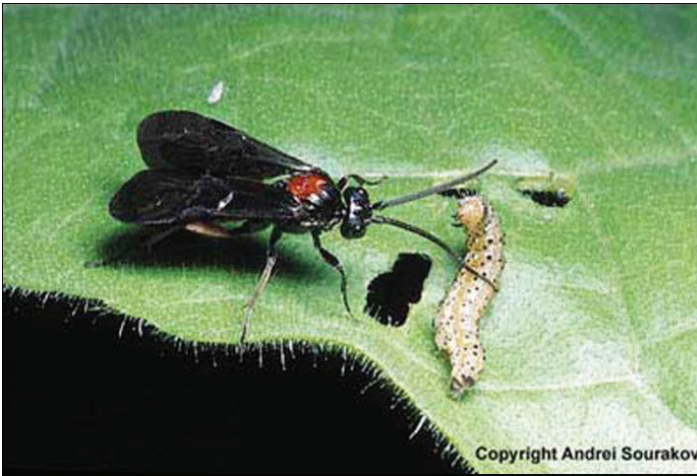
Figure 5. The wasp parasitoid Cardiochiles nigriceps Viereck, approaches a potential host, an adult tobacco budworm, Heliothis virescens (Fabricius).

Martin, P.B., P.D. Lingren, G.L. Greene, and R.L. Ridgway. 1976. "Parasitization of two species of Plusiinae and Heliothis spp. after releases of Trichogramma pretiosum in seven crops." Environ. Entomol. 5:991–995.