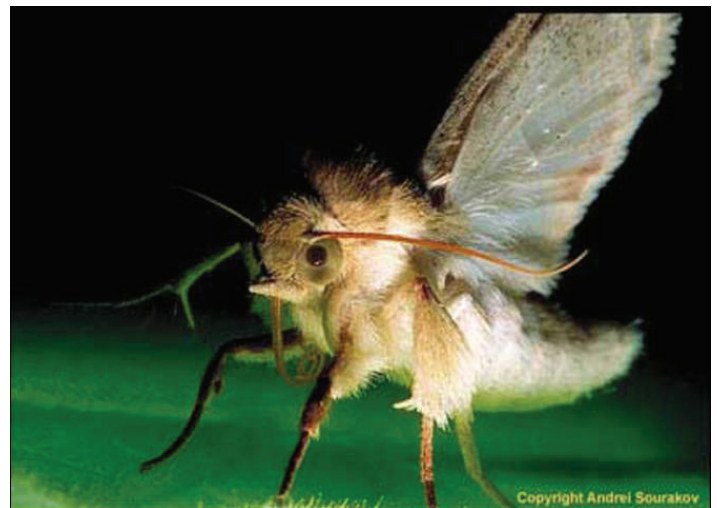
Figure 1. A closeup of an adult tobacco budworm, Heliothis virescens (Fabricius).

Moths emerge March through May in southern states, followed by four to five generations through the summer, with overwintering commencing September through November. Four generations have been reported from northern Florida and North Carolina, and at least five from Louisiana. Moths have been collected in New York July through September, but at such northern latitudes it is not considered to be a pest. This species overwinters in the pupal stage.