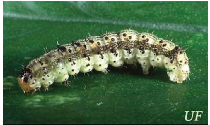
Figure 2. Larva of the tobacco budworm, Heliothis virescens (Fabricius).

Early instars are difficult to separate from corn earworm ; Neunzig (1964) gives distinguishing characteristics. Starting with the third instar, close examination reveals tubercles with small thorn-like microspines on the first, second, and eighth abdominal segments that are about half the height of the tubercles. In corn earworm the microspines on the tubercles are absent or up to one-fourth the height of the tubercle. Larvae exhibit cannibalistic behavior starting with the third or fourth instar but are not as aggressive as corn earworm.