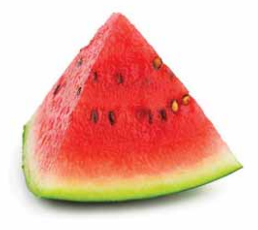
http://www2.shutterstock.com/blog/wpcontent/uploads/sites/5/2010/05/ free_watermelon_shutterstock_47597032_we b.jpg