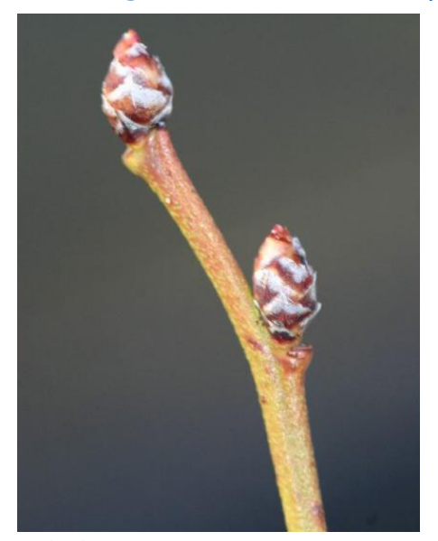
Figure 1. Flower bud stage 1.