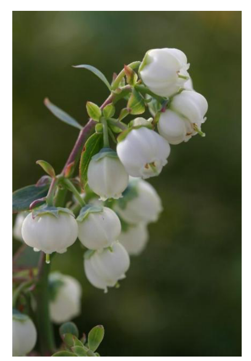
Figure 6. Flower bud stage 6.