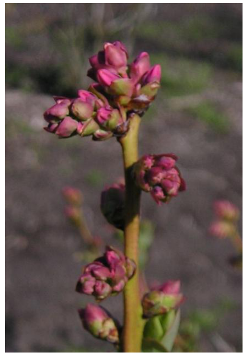
Figure 4. Flower bud stage 4.