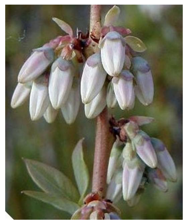
Figure 5. Flower bud stage 5.