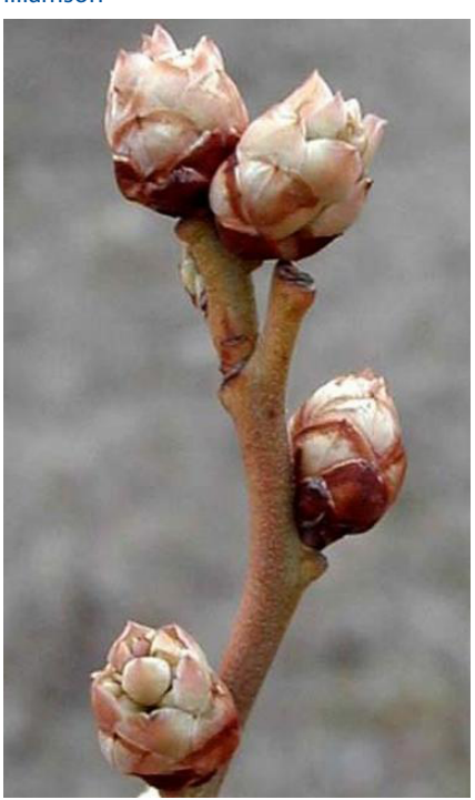
Figure 3. Flower bud stage 3.