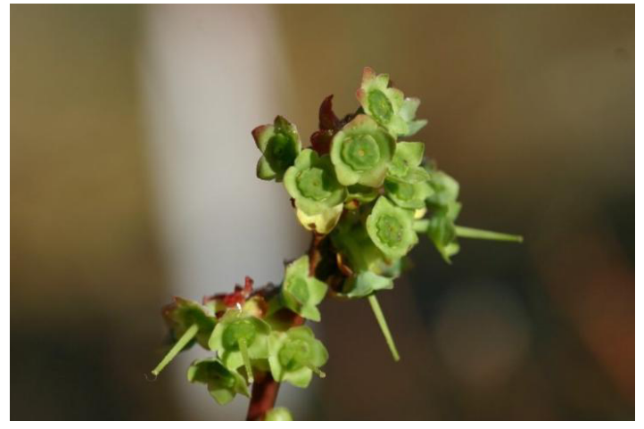
Figure 7. Flower bud stage 7.