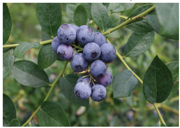
Figure 20. 'Sweetcrisp'.

'Sweetcrisp' (U.S. PP20,027) (Figure 20) was released by the University of Florida in 2005. It has a higher chilling requirement than is typically achieved in Florida. Its yield potential is only low to medium in Florida, which is a major reason 'Sweetcrisp' is not widely grown commercially in the state. However, it has been planted in U-pick operations. 'Sweetcrisp' berries are medium to large and have exceptional firmness, medium blue color, and a remarkably sweet flavor. As the name indicates, 'Sweetcrisp' fruit have a unique, crisp texture that has scored favorably in consumer acceptance trials. The postharvest characteristics of the berries are excellent, as is their ability to remain on the bush for extended periods without significant loss of quality. Fruit detach easily from the bush and have dry picking scars. 'Sweetcrisp' has shown higher than average potential for mechanical harvesting, although there is a tendency for immature green fruit to detach during mechanical harvesting due to low fruit-detachment force. Plants survive well in the field but have a vigorous, sprawling growth habit, which makes them somewhat difficult to manage. 'Sweetcrisp' has a relatively high chilling requirement and is best adapted from Gainesville north into southeast Georgia.