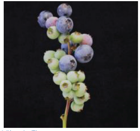
Figure 16. 'Keecrisp'™.

'Keecrisp'™ (U.S. PP27,771) (Figure 16) is a mid- to late-season cultivar released by the University of Florida in 2016. It has a higher chilling requirement than is typically achieved in Florida. It has an upright architecture, with high yield when it receives sufficient chilling, and is best adapted to a hydrogen cyanamide management system. Leafing can be delayed, even with hydrogen cyanamide application. Berries are crisp, with a small, dry picking scar, although coloring at the stem end can be uneven. 'Keecrisp'™ has demonstrated suitability for machine harvesting for fresh market production. Due to a somewhat higher chilling requirement, 'Keecrisp'™ is best adapted to areas with chilling higher than Gainesville, Florida.