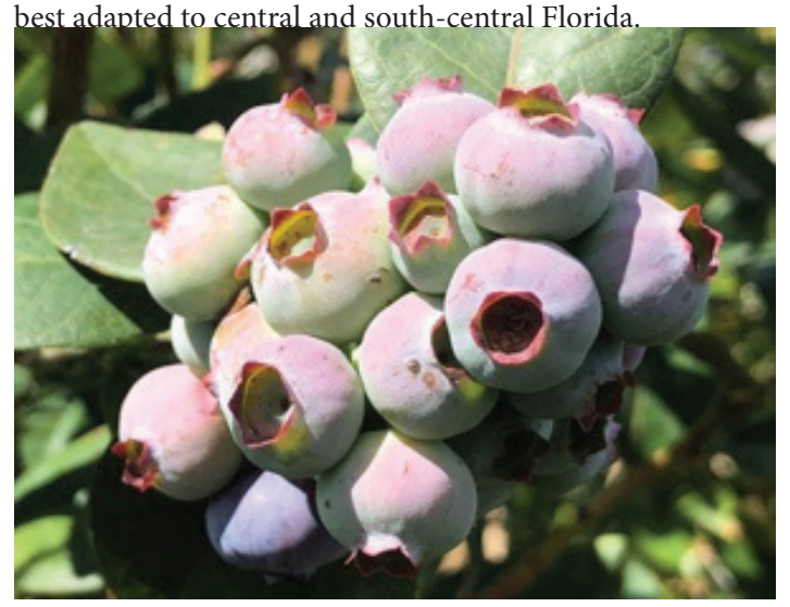
Figure 11. 'Kestrel'™.

'Kestrel'™ (U.S. PP21,719) (Figure 11) was released by the University of Florida in 2009. 'Kestrel'™ is a low-chill cultivar that blooms early and ripens very early. Berries are medium to large, with excellent flavor and low detachment force. Early leafing and flowering make 'Kestrel'™ particularly susceptible to late freezes. Berry detachment force is lower than average for blue fruit, which can result in loss of fruit following storms or windy conditions and may limit its potential for machine harvesting. Mite and thrip infestations have been reported on 'Kestrel'™. 'Kestrel'™ is