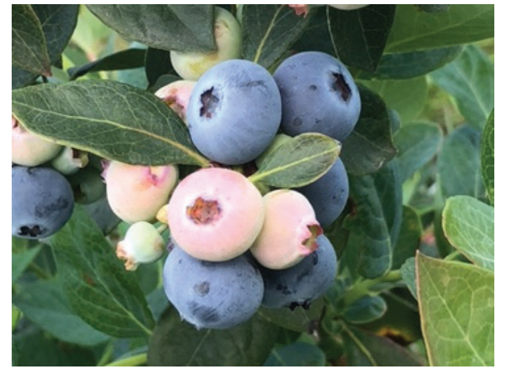
Figure 2. 'Sentinel'.

'Sentinel' (U.S. PP33,896) (Figure 2) was approved for release in 2020. 'Sentinel' is a vigorous, early-season, high-yielding cultivar with no known disease issues. The fruit is a little firmer than 'Emerald', and has scored high in consumer taste panels. It has performed well in both north-central and central Florida trial sites, and does not need hydrogen cyanamide applications. Trials are ongoing in south-central Florida.