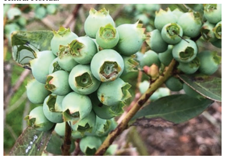
Figure 8. 'Chickadee'™.

'Chickadee' (U.S. PP21,376) (Figure 8) was released by the University of Florida in 2009. 'Chickadee'™ is a very early-ripening cultivar with a very low chilling requirement. The plant is upright, with stout stems and twigs, and has a narrow, almost monopodial, base. Berries are large and sweet with low acidity, and have a firm to semi-crisp texture. Berry quality is maintained on the bush longer than most other cultivars grown in Florida. However, due to a weak root system, plants are prone to uprooting from heavy ice loads during freeze protection or strong storms. In some situations, the weak root system may contribute to lower than normal plant vigor and a canopy that can be more sparse than other cultivars. 'Chickadee'™ does not respond well to heavy pruning, and susceptibility to algal stem blotch has been observed. 'Chickadee'™ has demonstrated a medium yield potential, but its low chill requirement and early maturity may find use in central and south-central Florida. 'Chickadee'™ is best adapted to central and southcentral Florida.