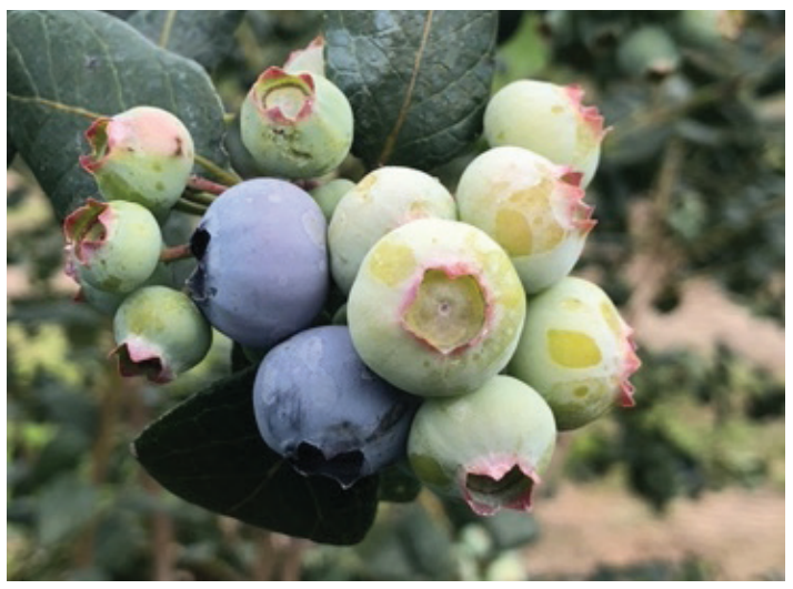
Figure 6. 'Arcadia'™. Credits: UF/IFAS Blueberry Breeding Program

susceptibility of all cultivars is ongoing. 'Arcadia'™ is still widely planted in central and south-central Florida because of its high yield. 'Arcadia'™ is best adapted to central and south-central Florida.