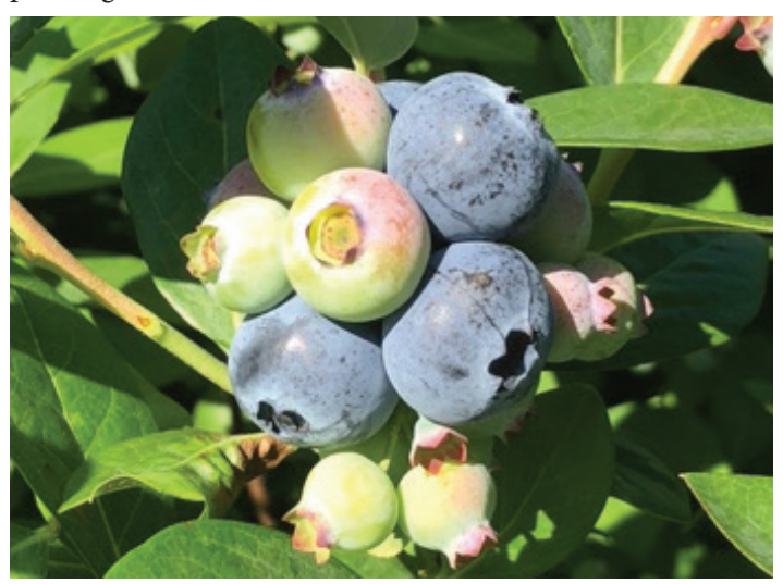
Figure 15. 'Jewel'.

injury from hydrogen cyanamide. 'Jewel' fruit are slightly smaller and softer than 'Emerald', but they are acceptable for commercial packing and shipping. Yield potential is high, and internal berry quality is very good, although berries tend to remain tart until fully ripe. 'Jewel' is considered a mid-season cultivar for Florida. 'Jewel' is best adapted for planting in north-central and central Florida.