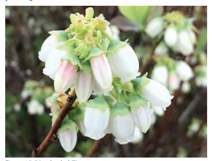
Figure 17. 'Meadowlark'™.

'Meadowlark'™ (U.S. PP21,553) (Figure 17) was released in 2009 by the University of Florida. In recent years, growers in north-central and central Florida have reported pollination issues and low yields on 'Meadowlark'™. It has greater than average susceptibility to bacterial leaf scorch (Xylella fastidiosa), which is observed more frequently in areas prone to flooding, and this has resulted in a decline in some plantings in Florida. It is vigorous with an upright growth habit and a very narrow crown, and it has the ability to leaf strongly during bloom and carry a heavy crop. Berries ripen very early when treated with hydrogen cyanamide. Berries are large to medium-large, depending on the crop load, and berry clusters are loose and easy to harvest because of their exceptionally long pedicels and peduncles. Berries have a mild flavor and are somewhat darker than average. Uniform color development at ripening is below average, with a tendency for red or purple color to persist at the stem end while the rest of the berry is fully blue. Berry firmness is very good. Because of its fruit firmness, 'Meadowlark'™ has been successfully harvested using machines under commercial production. 'Meadowlark' ^{\scriptscriptstyle\mathsf{TM}} is best adapted for planting in north-central and central Florida.