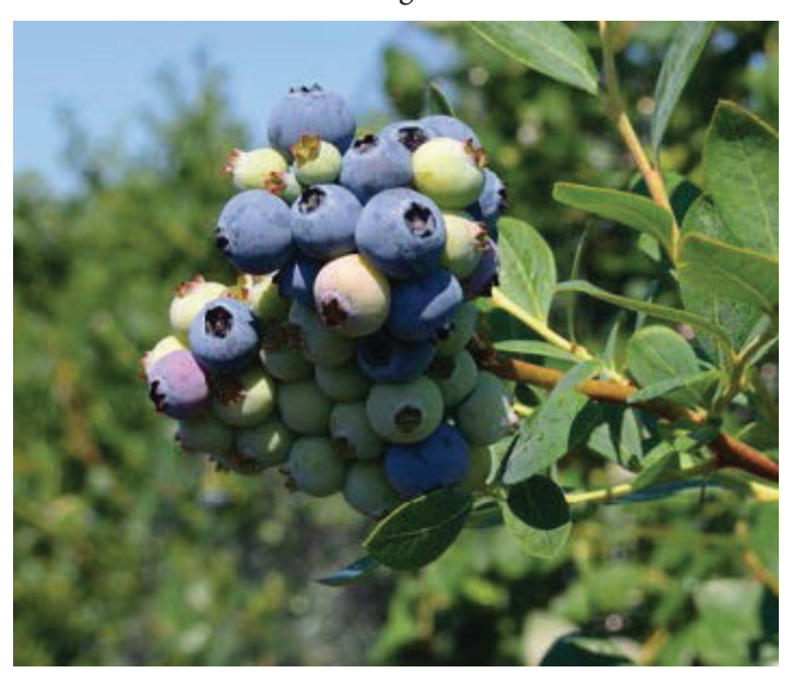
Figure 21. 'Wayne'.

'Wayne' (U.S. PP32,182) (Figure 21) is an early-maturing cultivar released by the University of Florida in 2017. UF is still collecting performance data on this cultivar under commercial production systems. Fruit is similar to 'Jewel' but firmer on average with earlier production; it is typically two weeks earlier than Jewel when no hydrogen cyanamide is used. 'Wayne' has similar yield potential as 'Jewel'. Low doses of hydrogen cyanamide are recommended. Similar leaf diseases as 'Jewel' have been observed. Due to somewhat higher chilling requirements, 'Wayne' is best adapted to the north-central Florida region.