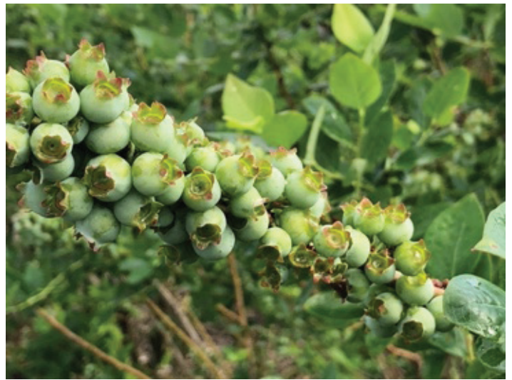
Figure 9. 'Emerald'.

'Emerald' (U.S. PP12,165) (Figure 9) was released by the University of Florida in 1999 and is one of the most widely planted cultivars in central Florida. 'Emerald' combines a vigorous, upright-spreading bush with high yield potential and large, high-quality berries. 'Emerald' flowers open uniformly. It produces abundant leaves, but may benefit from hydrogen cyanamide applications. Because the plants are highly vigorous when planted on suitable soils, 'Emerald' is capable of carrying heavy crops and is generally considered one of the higher-yielding cultivars grown in central Florida. Fruit clusters are tight and do not ripen uniformly, which makes 'Emerald' more difficult to handpick than many cultivars. 'Emerald' is considered a mid-season cultivar for Florida with an extended harvest season. 'Emerald' is best adapted for planting in northcentral and central Florida.