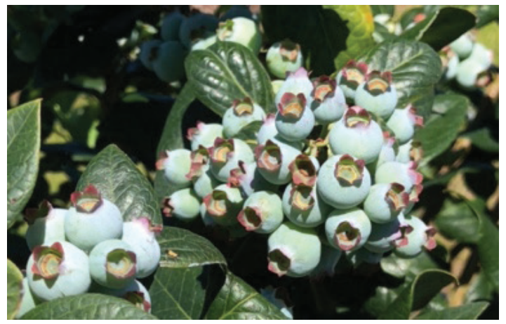
Figure 1. 'Albus'. Credits: UF/IFAS Blueberry Breeding Program

'Sentinel' (U.S. PP33,896) (Figure 2) was approved for release in 2020. 'Sentinel' is a vigorous, early-season, high-yielding cultivar with no known disease issues. The fruit is a little firmer than 'Emerald', and has scored high in consumer taste panels. It has performed well in both north-central and central Florida trial sites, and does not need hydrogen cyanamide applications. Trials are ongoing in south-central Florida.