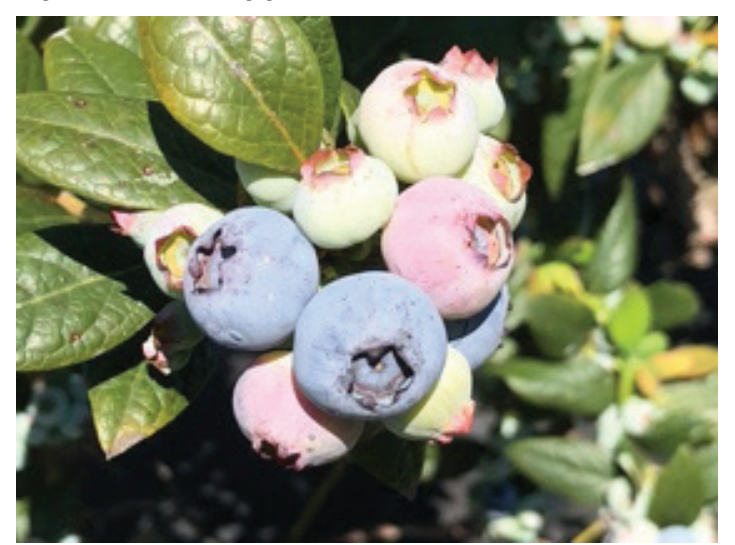
Figure 13. 'Endura'™.

market. It has shown some susceptibility to stem blight. This variety has low survival in areas with standing water, so these areas should be avoided. Due to higher chilling requirements, 'Indigocrisp'™ appears best adapted to regions with chilling greater than Gainesville, Florida.