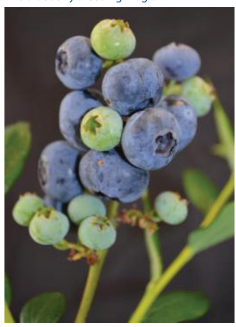
Figure 14. 'Indigocrisp'™.

'Jewel' (U.S. PP11,807) (Figure 15) was released from the University of Florida breeding program in 1998, and has often been planted in combination with 'Emerald' in central and north-central Florida. However, 'Jewel' is highly susceptible to blueberry rust leaf spot in Florida, and a thorough summer spray program is usually necessary to prevent early fall defoliation. The plant is upright, vigorous, and high-yielding, and it survives well in commercial fields. Under low chilling conditions, 'Jewel' is susceptible to