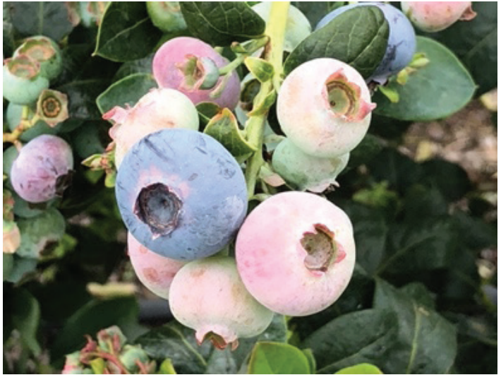
Figure 3. 'Colossus'.

'Colossus' (U.S.PP33,802) (Figure 3) was approved for release in 2019. It has very large to jumbo-sized fruit with very high fruit firmness, and has performed well in machine harvest trials. It also has concentrated ripening and good early natural leafing. 'Colossus' blooms somewhat later with a short bloom-to-ripening period (fitting well within the Florida market window), and appears to be best adapted to the north-central Florida region. Trials are ongoing in the central Florida region.