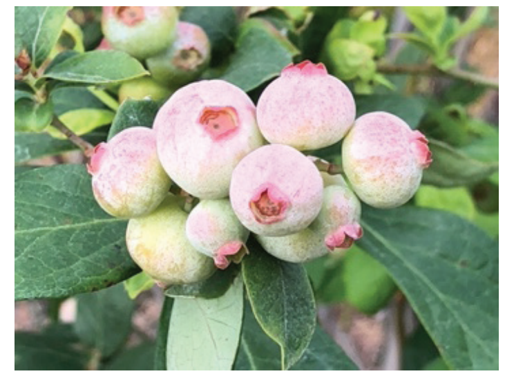
Figure 19. 'Springhigh'.

'Springhigh' (U.S. PP16,476) (Figure 19) was released by the University of Florida in 2004. It was somewhat popular as an earlier-ripening addition to mid-season cultivars such as 'Emerald' and 'Jewel', especially in central Florida. However, the pack-out for 'Springhigh' in Florida has been reduced in some years because of a higher than average incidence of soft berries. Picking at frequent intervals during the harvest season is necessary to minimize the occurrence of soft fruit in packing and grading lines. Some packers may not accept 'Springhigh' fruit due to postharvest quality issues. Fruit are large and have excellent flavor, but have less waxy bloom, making them appear darker than average. Fruit are also softer than most other commercial cultivars. Before planting 'Springhigh', growers should carefully evaluate the market potential for this cultivar.