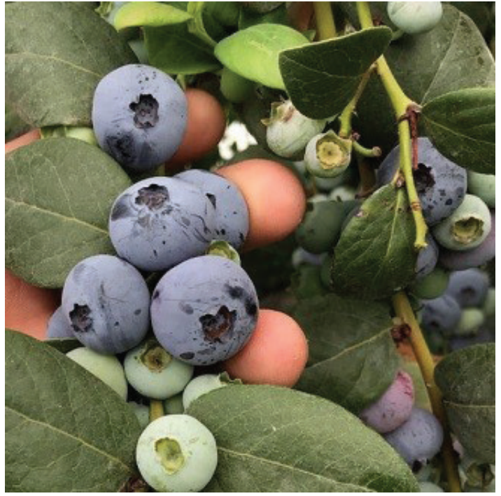
Figure 4. 'Magnus'.

'Magnus' (U.S. PP32,181) (Figure 4) was approved for release in 2017. It is an early-maturing cultivar for hand harvest during the Florida window for the fresh fruit market. 'Magnus' is very consistent across seasons and has been successful in both hydrogen cyanamide and non-hydrogen cyanamide production systems. However, if hydrogen cyanamide is used in production, only very low doses are recommended. The fruit is large (similar to 'Emerald'), although not considered firm enough for machine harvesting. It is less vigorous than 'Emerald' and may require freeze protection in January. Due to somewhat higher chilling requirements, 'Magnus' is best adapted to the north-central Florida region.