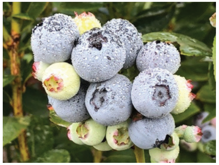
Figure 7. 'Avanti'™. Credits: UF/IFAS Blueberry Breeding Program

'Avanti'<sup>TM</sup> (U.S. PP26,312) (Figure 7) is a very early-ripening cultivar with a very low chill requirement, released by the University of Florida in 2015. Yield potential in an evergreen system is above average. The fruit are firm and high quality, with a small, dry picking scar. Fruit can be smaller compared to some other cultivars, particularly late in the season. Susceptibility to Botrytis fruit rot has been reported. 'Avanti'<sup>TM</sup> also has higher susceptibility to damage from mites and chilli thrips. Early bloom may require longer periods of freeze protection in certain regions. 'Avanti'<sup>TM</sup> is well-suited for evergreen production in low-chill regions of central and south-central Florida, where fruit has ripened as early as late January.