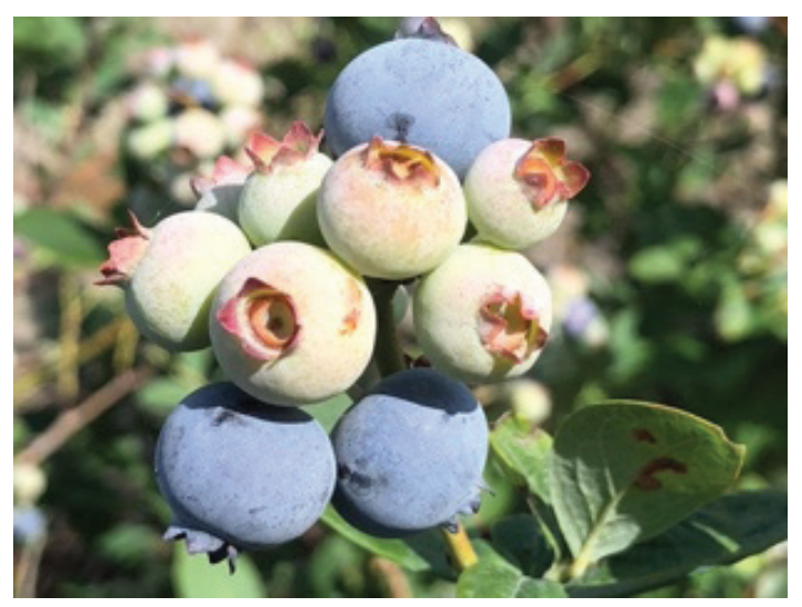
Figure 12. 'Patrecia'.

'Patrecia' (U.S. PP27,740) (Figure 12) is an early- to midmaturing cultivar released by the University of Florida in 2016. It has an upright architecture, and high yield with adequate chilling. Late blooming may require less freeze protection compared to other cultivars. Berries are large with very uniform ripening, but they have a larger than desired picking scar that can tear during harvest. The fruit cluster is tight, requiring hand harvesting, and is not recommended for machine harvesting (using current technology). This cultivar produces best with a hydrogen cyanamide management system. Due to a somewhat higher chilling requirement, 'Patrecia' is best adapted to northcentral Florida.