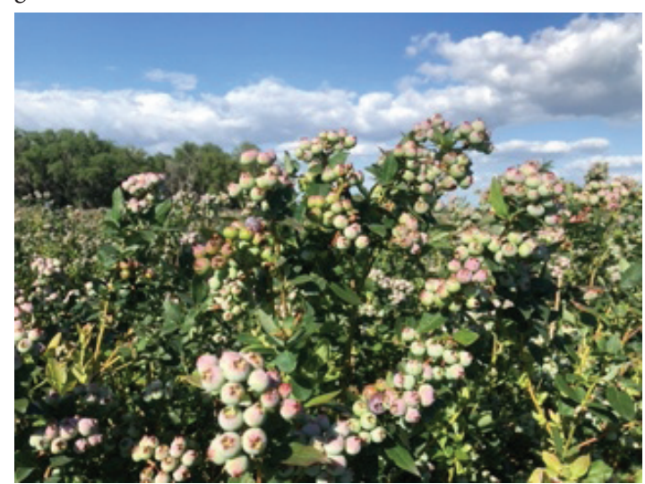
Figure 10. 'Farthing'.

'Farthing' (U.S. PP19,341) (Figure 10) was released by the University of Florida in 2007. It is vigorous with a compact growth habit and numerous branches. Flowering occurs after 'Emerald'. 'Farthing' flowers profusely and sets heavy crops with a long harvest season. Berry size is usually medium due to heavy crop loads, but can be large with lighter crops. Berry firmness is exceptional, with a nearly crisp texture. Scar and flavor are good. Berry color is darker than average, with below average uniform color development at ripening. This is due to a tendency for the stem end of the berry to remain red or purple, especially when plants are carrying heavy crops or in tunnel production. Because of its fruit firmness and ability for ripe fruit to persist on the bush longer than average, 'Farthing' has been successfully harvested using machines under commercial production. 'Farthing' is best adapted for planting in north-central Florida, although in some cases it has been successfully grown in central Florida.