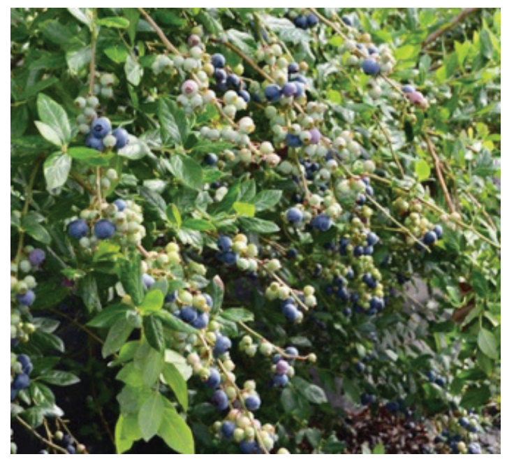
Figure 5. 'Optimus'. Credits: UF/IFAS Blueberry Breeding Program

'Optimus' (U.S. PP32,028) (Figure 5) was also approved for release in 2017. It is an early-maturing cultivar suitable for machine harvest for the fresh market. Berries are firm, medium-sized, and high quality, and the bush has good natural leafing. No or very low doses of hydrogen cyanamide are suggested, because high damage with traditional doses has been observed. Some chilli thrips damage has been observed in the summer, but no reduction in yield has been observed. 'Optimus' may require freeze protection in January. 'Optimus' has been reported to produce well across all of Florida, with the best production in north Florida.