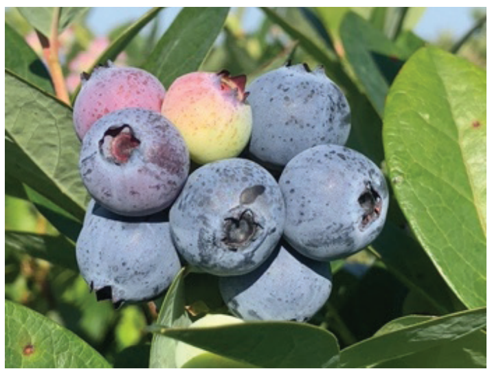
Figure 18. 'Primadonna'.

'Primadonna' (U.S. PP20,181) (Figure 18) was released in 2005 by the University of Florida. It tends to produce well in some years but not others in Florida for reasons that defy a clear explanation. Because of its early maturity and apparent low chilling requirement for the flower buds, 'Primadonna' has been planted in central Florida with varying levels of success. In these areas, 'Primadonna' may leaf poorly without the benefit of hydrogen cyanamide. However, hydrogen cyanamide often injures 'Primadonna' flower buds during low-chill winters. It blooms and ripens early, and its berries are large and have excellent flavor.