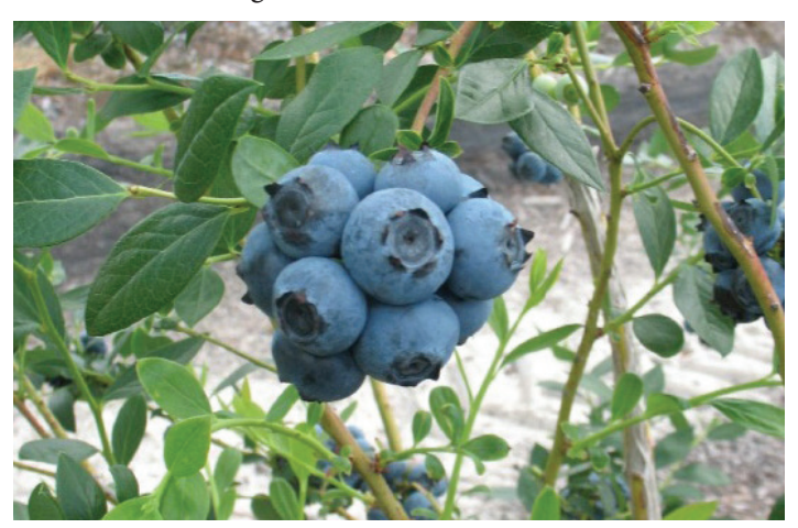
Figure 22. 'Star'. Credits: Jeff Williamson

'Star' (U.S. PP10,675)(Figure 22) was released by the University of Florida in 1995, and was widely planted in the northern production areas of Florida and in southeast Georgia. It has not performed well south of Ocala, Florida, where it tended to produce few flowers and exhibit weak growth. Although 'Star' was historically a major cultivar for Florida and south Georgia, its ability to survive in the field came into question due to a high incidence of bacterial leaf scorch caused by the bacterium Xylella fastidiosa, and its apparent susceptibility to blueberry necrotic ring blotch virus. 'Star' has a slightly higher chill requirement than most other cultivars grown in Florida, and it is less likely to bloom in January or early February. 'Star' leafs well in Gainesville and southeastern Georgia, but is less vigorous and smaller in stature than many cultivars. 'Star' has a very short bloom-to-ripe interval and a relatively compressed harvest season of about three weeks, with marginal yields reported in Florida. Berries are easy to harvest by hand, and the quality is excellent with regards to size, firmness, and scar. Due to its slightly higher than average chill requirement, 'Star' is best adapted to north Florida and southeastern Georgia.