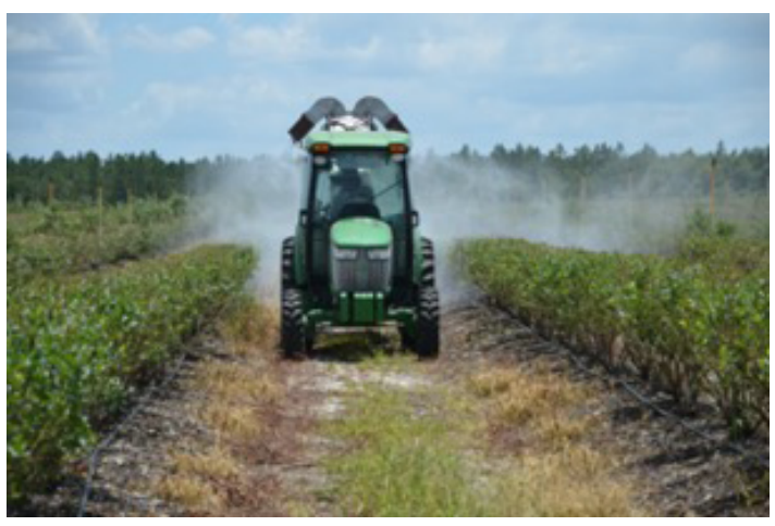
Figure 6. Fungicide application immediately following summer pruning.