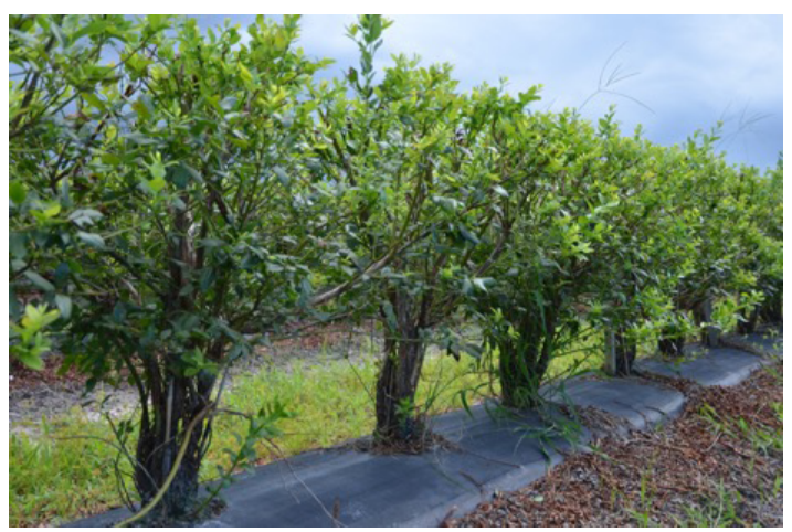
Figure 2. 'Farthing' plant previously trained to a narrow crown with cartons.

trimming the sides of the plant so they do not overhang into the row middles. This method significantly reduces the cost of hedging compared to hand pruning. Growers on smaller farms may use handheld gas-powered trimmers. While many growers hedge straight across the top of the plant (Figure 3), some growers prefer a "rooftop" cut angled 45-55 degrees up to a point in the center of the plant canopy (Figure 4). Hedging promotes growth of the plant canopy and new fruiting wood; it is essential to vigorous, healthy growth throughout the summer and to maintaining consistent yield (Figure 5). Hedging also allows greater sunlight penetration into the canopy, possibly increasing the number of flower buds. While most southern highbush cultivars respond well to this pruning, it should be noted that 'Chickadee' does not. Several growers have reported that 'Chickadee' can struggle to achieve significant regrowth following hedging, especially after the plant is around 2 years old. These growers have adopted the practice of lightly tipping 'Chickadee' following harvest instead of the typical hedging.