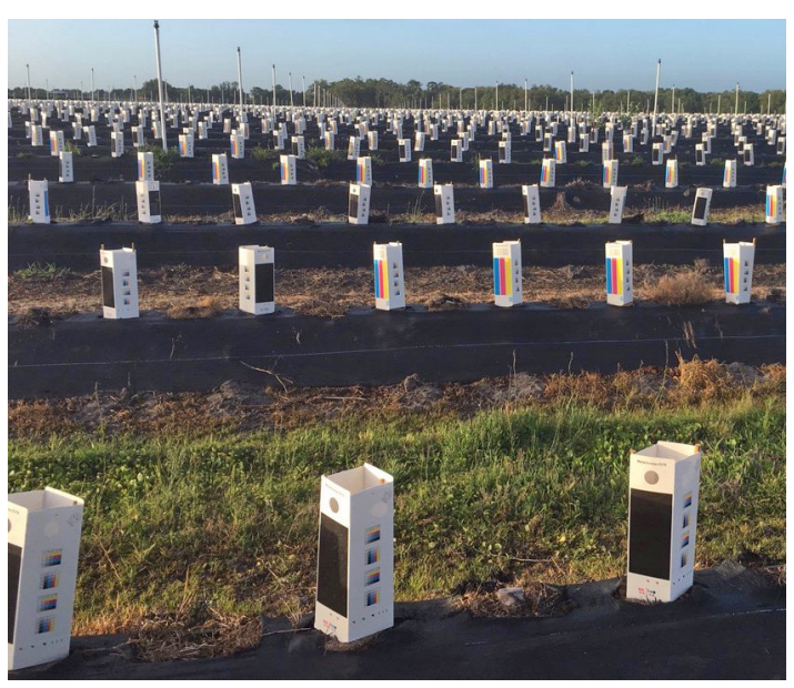
Figure 1. Cardboard cartons on young blueberry plants.

cultivars) reduce the need for pruning of suckers emerging from the bottom of the plant. However, once the cartons are removed, continued pruning at the base of the plant is needed to maintain a narrow crown.