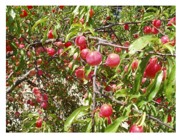
Figure 1. Chickasaw plum in full fruit.

Contributed by: USDA NRCS Manhattan Plant Materials Center & Kansas State University, Forestry Research