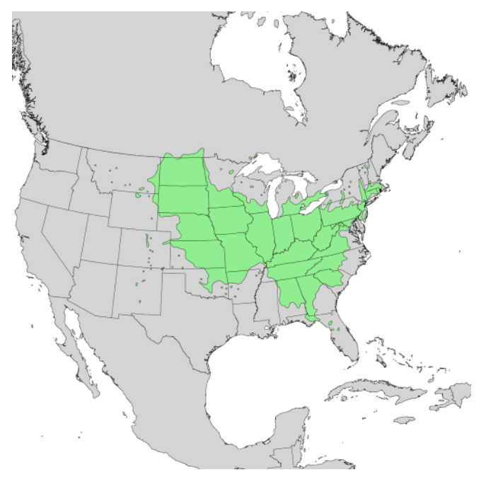
Fig. 2: American plum native range map. Data: Little (1971). Map: United States Geological Survey (USGS)

From March to May, showy, white flowers with 5 petals appear in clusters at the ends of branchlets (Fig. 3). Flowers are 1 inch (in) or 2.54 centimeters (cm) across, with long stamens that give them a hair-like appearance. Simple, oval to elliptical leaves are 3 - 4 in (7.6 - 10 cm) long, the edges of the leaves are shaped like a saw's teeth (serrated), have a pointed tip, and are green on the leaf surface and paler green below (Stevens & Kaiser, 2000). Leaves emerge off the branch in an alternate arrangement. The round plum fruits (drupe) are about 1-inch in diameter with yellow to reddish-purple flesh that contains one seed (pit). Plums ripen throughout the summer. When the plant is young, the bark is smooth and reddish gray with numerous horizontal lenticels, which appear as light-colored slits in the bark that vary from 1/8 in to 1/2 in long. As the plant matures, the bark develops irregular ridges and exfoliating strips that curl. The reddish-brown twigs are slender and have raised leaf scars and reddish-grey, sharp-pointed buds. Branches may develop thorn-like short branches.