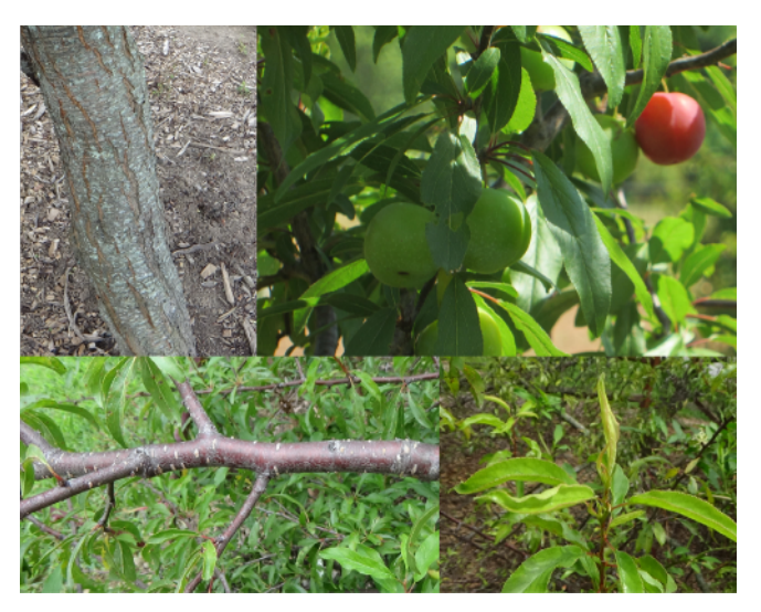
Fig. 5: Chickasaw plum (clockwise from top left) bark on trunk, unripe and ripe fruit, leaves, and bark on branches.