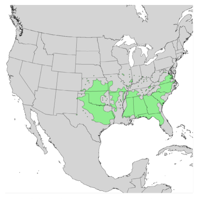
Fig. 4: Chickasaw plum native range map. Data: Little (1971). Map: USGS

From February to April, Chickasaw plums produce abundant, fragrant flowers (Fig. 5). The small, white, 5-petaled flowers are a 1/3 in (0.8 cm) across and have orange anthers. They occur in clusters on side twigs and tips of branches. Chickasaw plum leaves are shorter and narrower than American plum leaves. The narrow, pointed leaves are 1.5 - 3 in (3.8 - 7.6 cm) long and .25 - 4/5 in (0.16 - 0.3 cm) wide with a finely serrated leaf edge. The leaves are alternately arranged; have a shiny, dark green leaf surface that is lighter below; and angle upward along the midrib creating an elongated trough (Row & Geyer, 2010). The fruit is a round, 1/3 - 1/2 in (0.83 - 1.3) cm) yellow to red fleshy plum, ripening from June to August and containing one pit. Ripe plums have a whitish appearance (bloom) on the skin. Bark on younger trees is similar to American plum; however, in comparison, bark on mature Chickasaw plums is scaly and contains cracks and shallow furrows. Twigs are slender, zig-zag in appearance, and reddish brown with raised leaf scars, thorny branches, and small red buds.