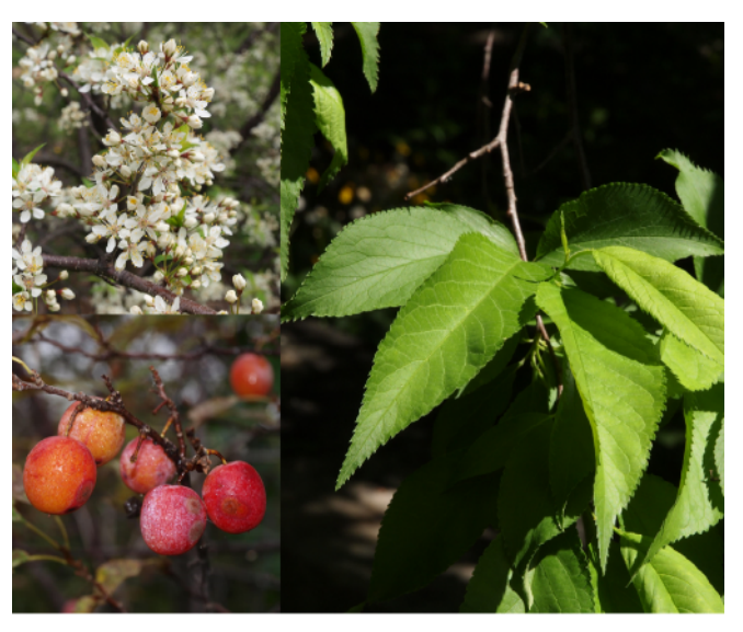
Fig. 3: American plum flowers (top left), ripe fruit (bottom left), and leaves (right).