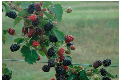
Fig. 2. 'Prime-Ark ® Freedom' with fruits on floricanes, Fruit Research Station, Clarksville, AR.

Fruit of 'Prime-Ark ® Freedom' is elongated to blocky and attractive with a glossy, black finish (Figs. 2 and 3). Fruit shape varies on primocanes and can be reduced in