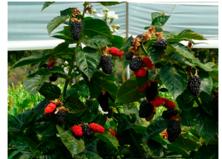
Fig. 3. 'Prime-Ark ® Freedom' with fruits on primocane, Watsonville, CA.