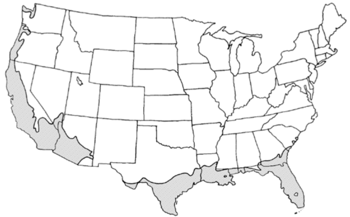
Figure 2. Range

Availability: not native to North America