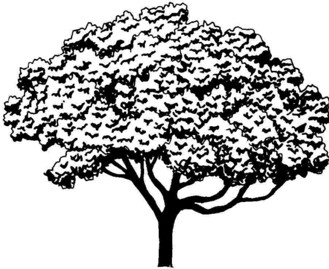
Figure 1. Mature Arbutus unedo : Strawberry-Tree

Most often seen as a multi-stemmed, rounded, evergreen shrub or small tree reaching 8 to 15 feet in height with an equal spread, Strawberry-Tree is capable of reaching 20 to 25 feet in height, and makes a very attractive specimen tree when pruned to a short, single trunk. The trees take on a picturesque, somewhat twisted appearance over time, and exhibit dark, red/brown, flaking and shreddy bark accompanied by the lush, dark green, leathery, red-stemmed leaves. Growth rate is slow so trees over 20 feet tall are rare.