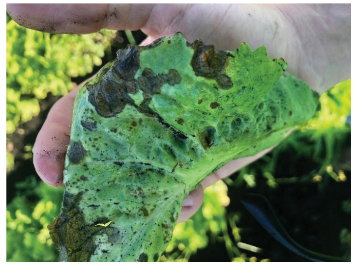
Figure 3. Escarole showing bacterial leaf spot, presumably caused by Pseudomonas spp.

the Vegetable Production Handbook of Florida, published yearly at https://edis.ifas.ufl.edu/publication/CV293.