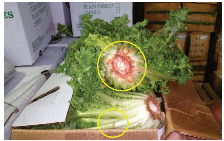
Figure 4. Pink rib disorder in packed escarole is evident on the cutends and at cracks in the stems (circled).