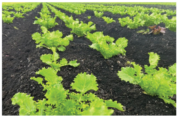
Figure 1. Escarole field in the Everglades Agricultural Area in southern Florida cultivated in rich, organic "muck" soils.

In Florida, these leafy vegetables are planted in the Everglades Agricultural Area in southern Florida from October to March and harvested throughout that time. Escarole and endive grow as rosettes similar to leaf lettuce (Figures 1 and 2). Both leafy vegetables are available to consumers in the winter months. This publication aims to create awareness of endive and escarole production in Florida; it is designed for consumers, growers, Extension faculty, and students.